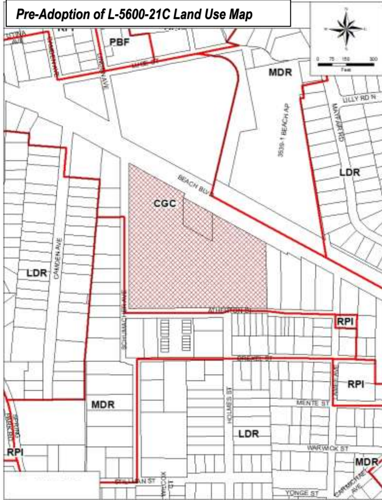
Pre-Adoption of L-5600-21C Land Use Map