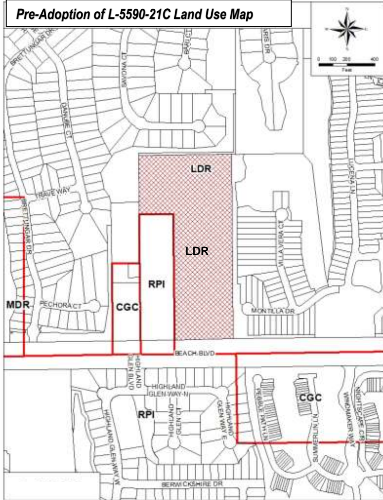
Pre-Adoption of L-5590-21C Land Use Map