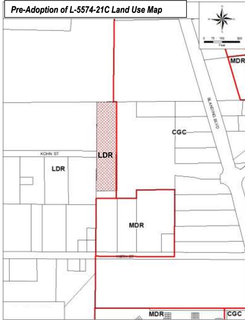
Pre-Adoption of L-5574-21C Land Use Map