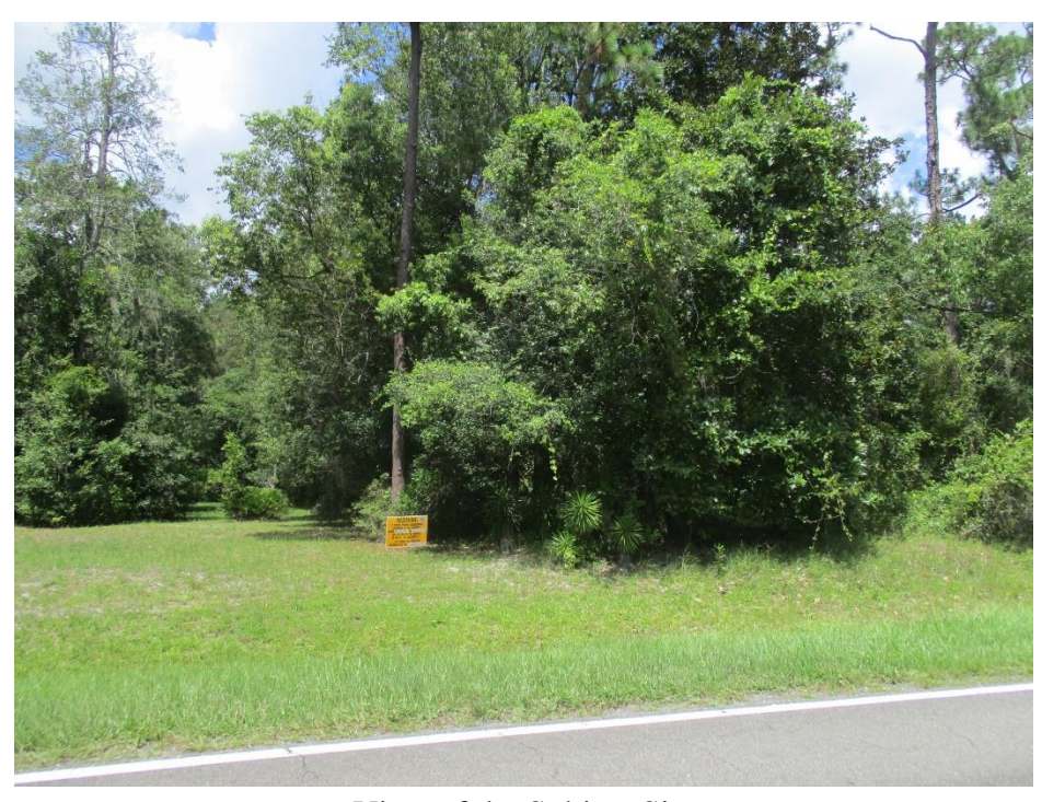
View of the Subject Site