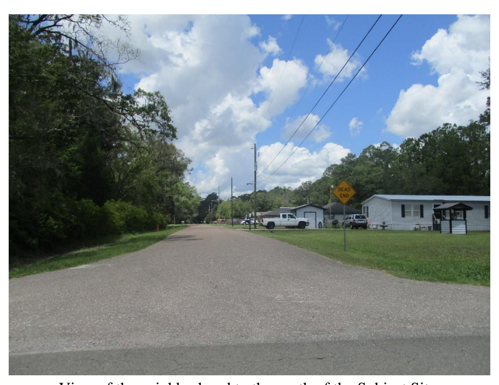
View of the neighborhood to the south of the Subject Site.