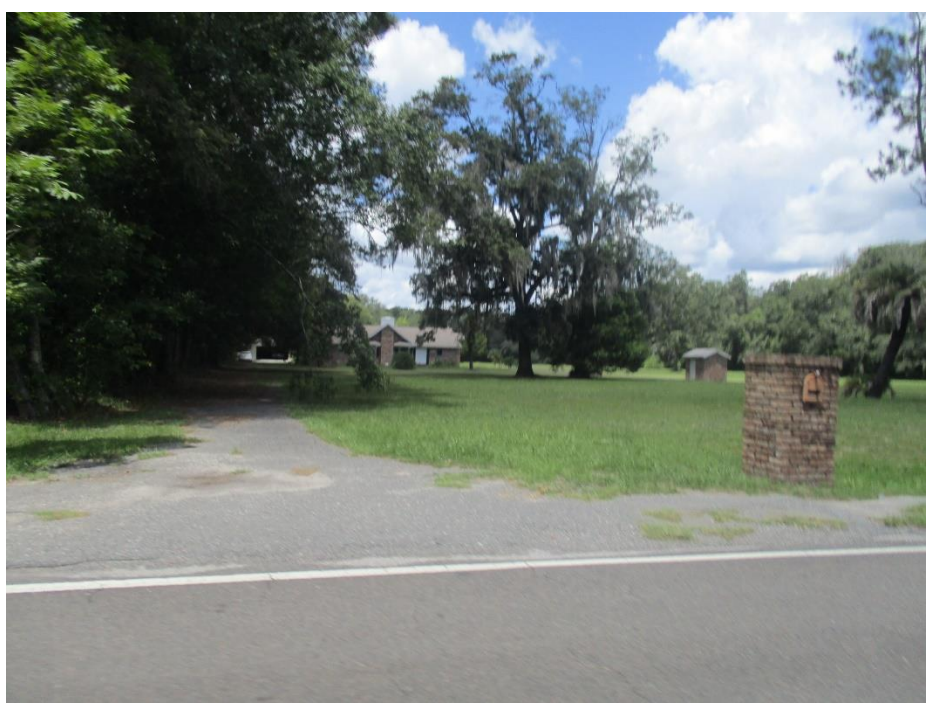
View of the neighboring property to the north

Date: July 27, 2020