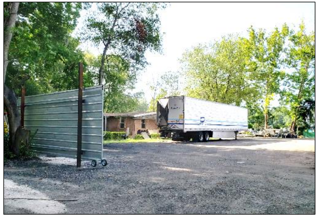
View of Subject Property Source: Planning & Development Department 06/30/2020