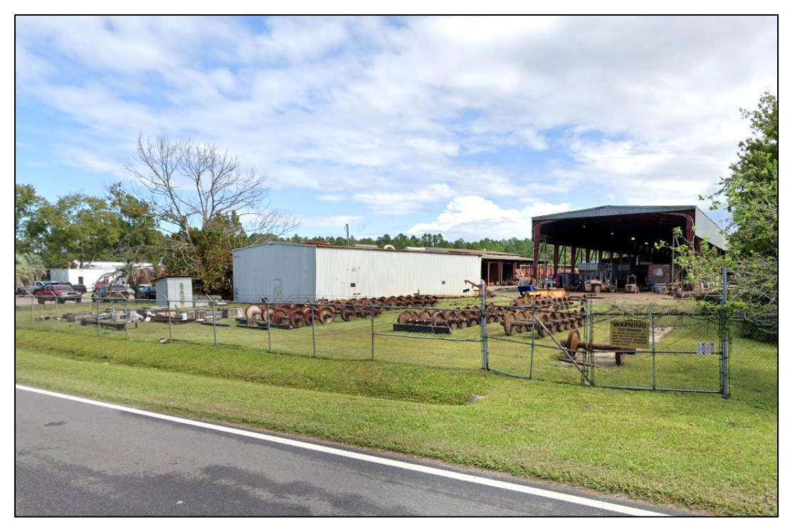
View of Property to the North