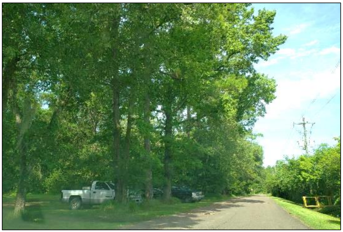
Looking West along Union Heights Road Source: Planning & Development Department 06/30/2020