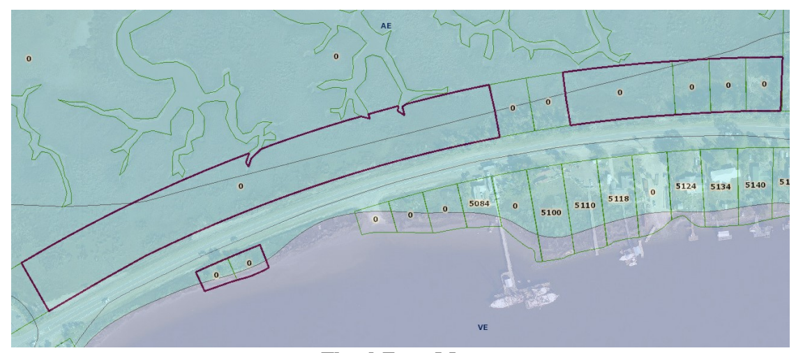
Flood Zone Map

Approximately 0.10 of an acre of the subject site is located within the VE flood zone. The rest of the subject site is entirely within the AE flood zone. The VE flood zone is defined as an area within the 100-year coastal floodplain or SFHA that also has additional hazards associated with storm waves. Flood zone designations are assigned by the Federal Emergency Management Agency (FEMA). FEMA defines the various flooding characteristics of different lands based on a 100-year storm. The 100-year storm of Special Flood Hazard Area (SFHA) refers to a flood occurring from a storm event that happens an average of every 100 years. In result, any development within the floodplain will be required to comply with Chapter 652, the Floodplain Management Ordinance.