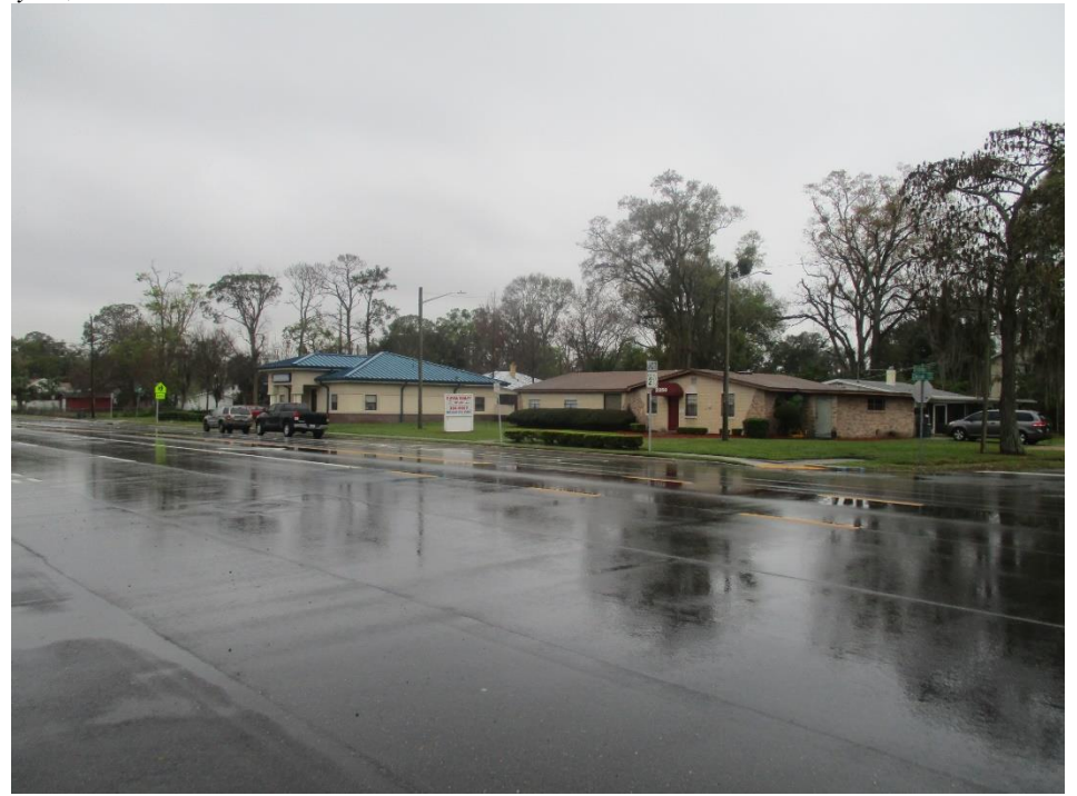
View of the neighboring properties across Cassat Avenue to the South.

Date: February 25, 2020