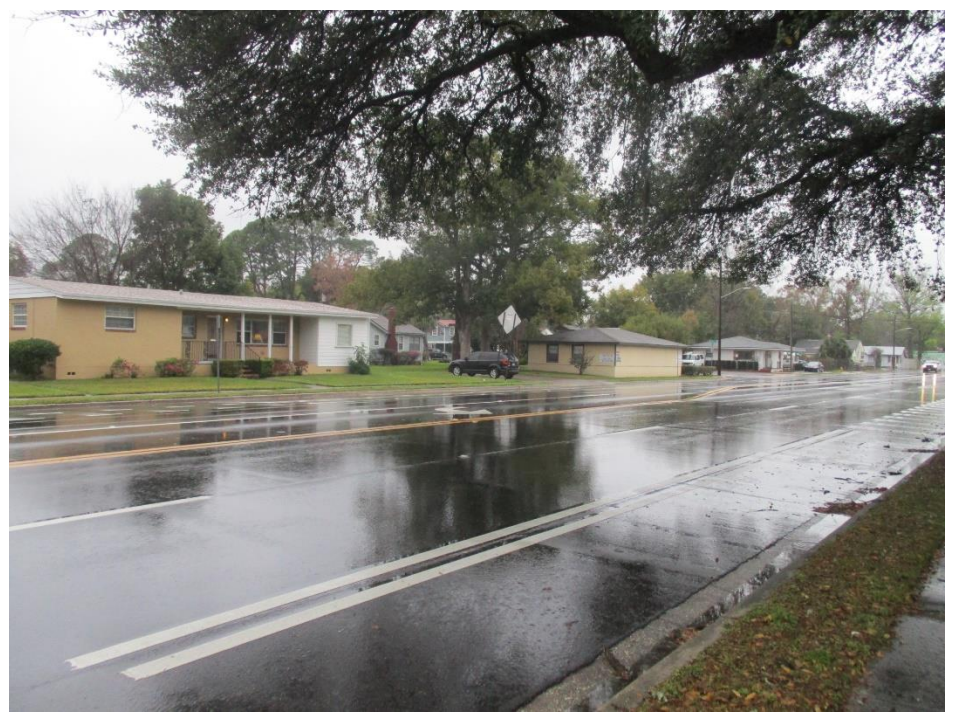
View of the neighboring properties across Cassat Avenue to the North

Date: February 25, 2020