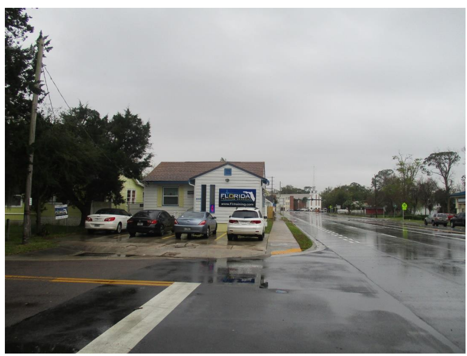
View of the neighboring property across Sunderland Road.

Date: February 25, 2020