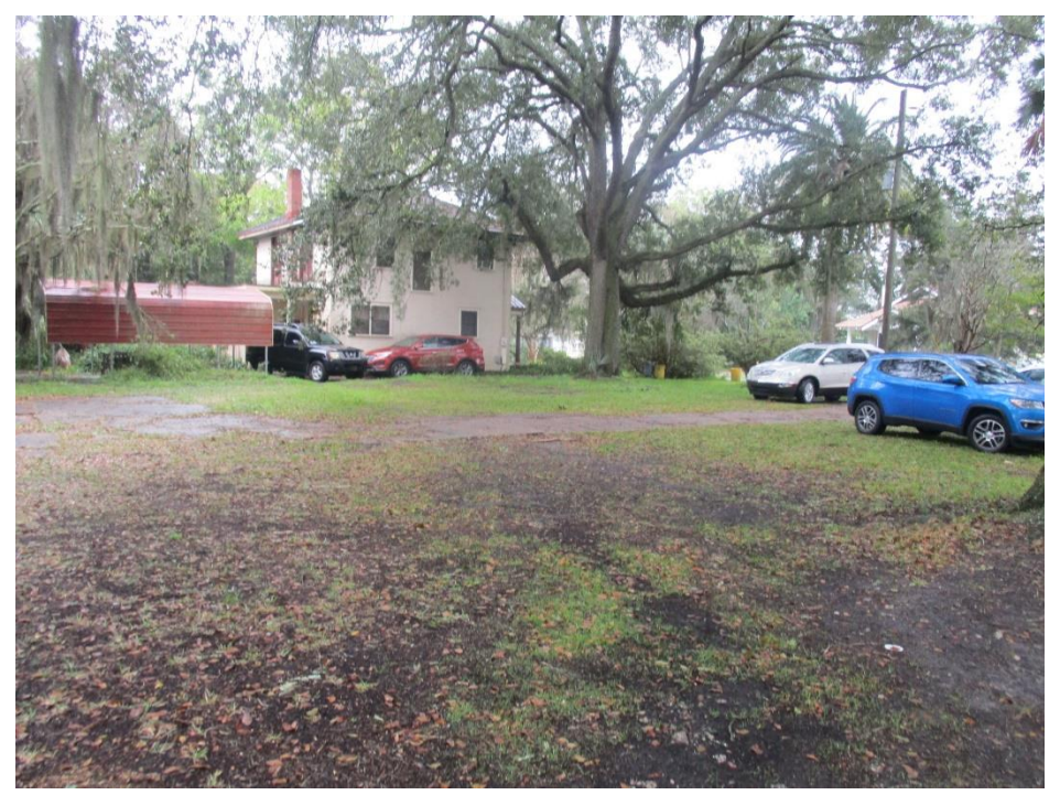
View of the Subject Property

Date: February 25, 2020