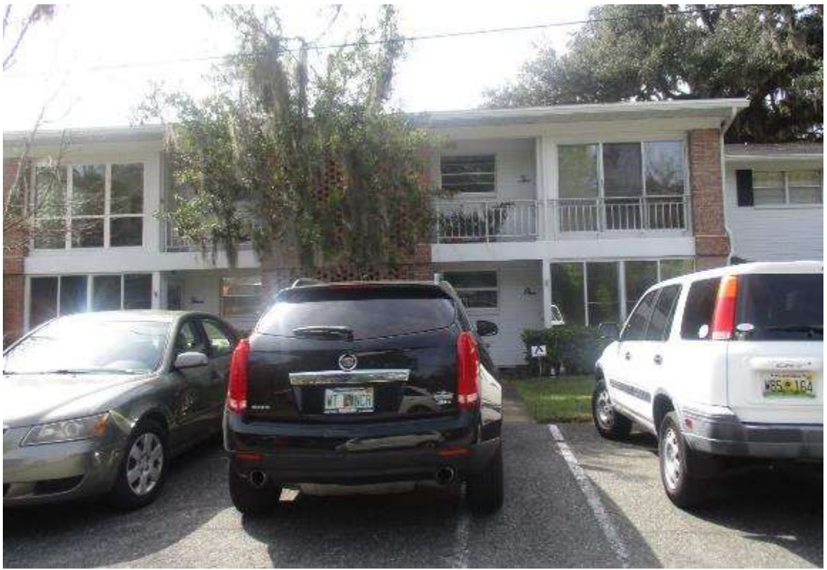
Adjacent multi-family structure