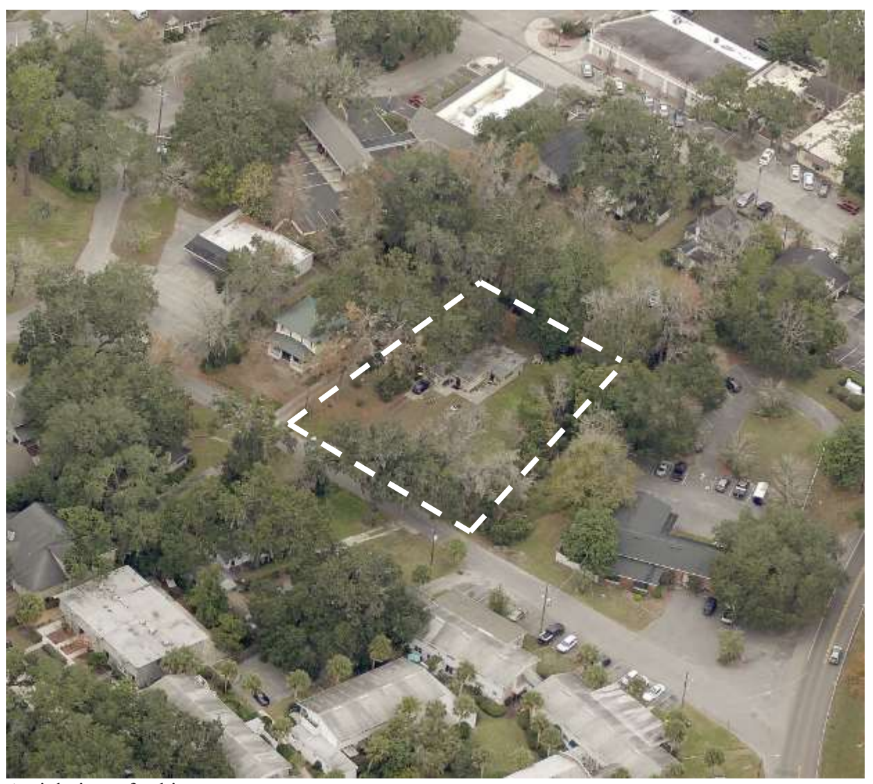
Aerial view of subject property