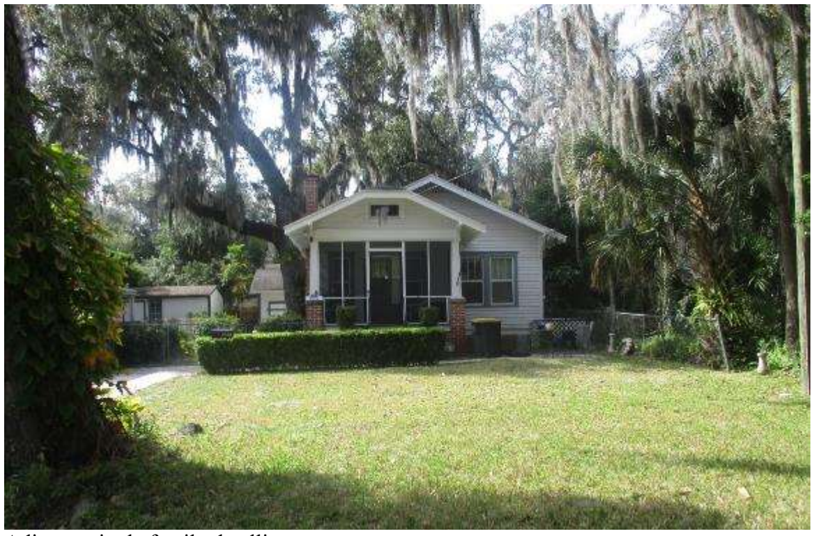
Adjacent single family dwelling