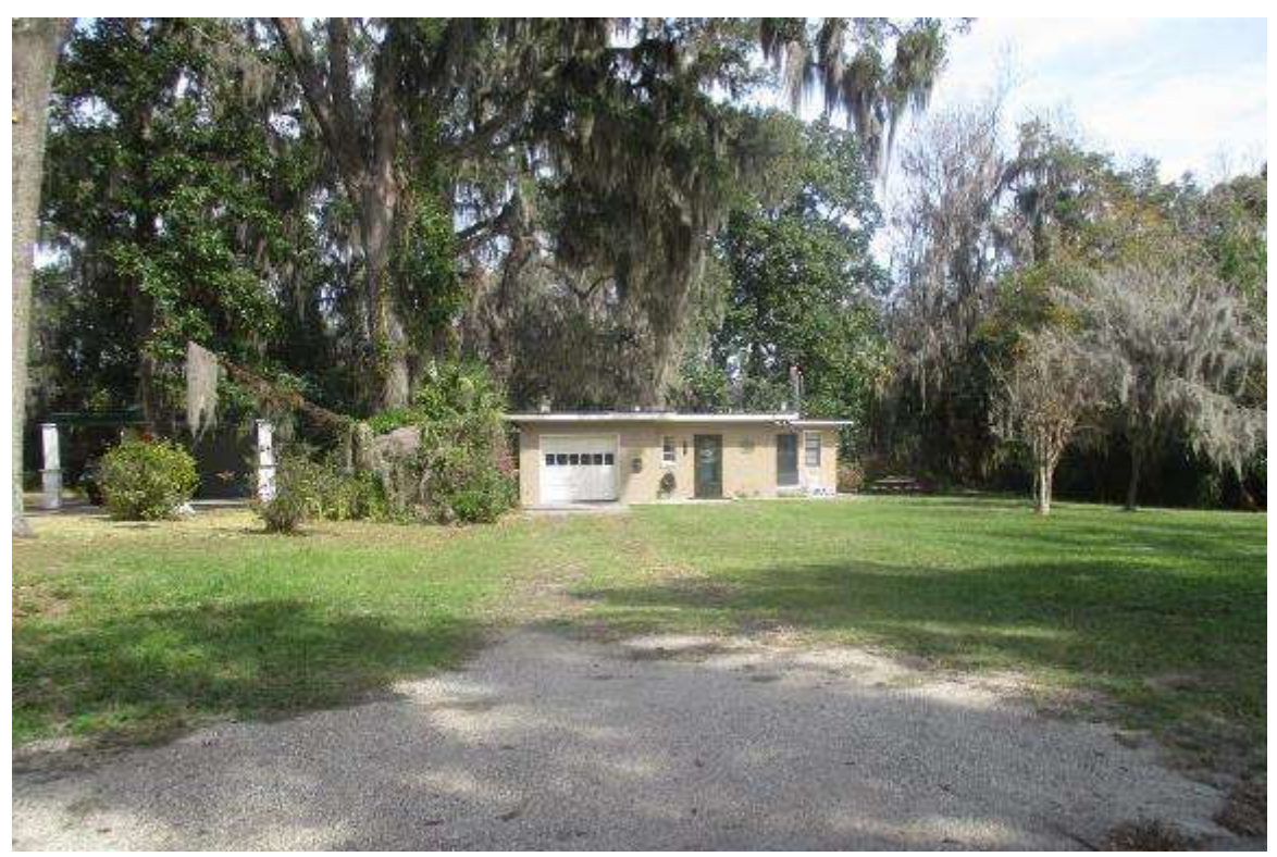
View of subject property