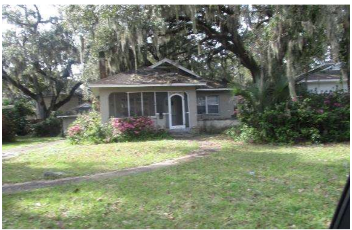
Adjacent single family dwelling