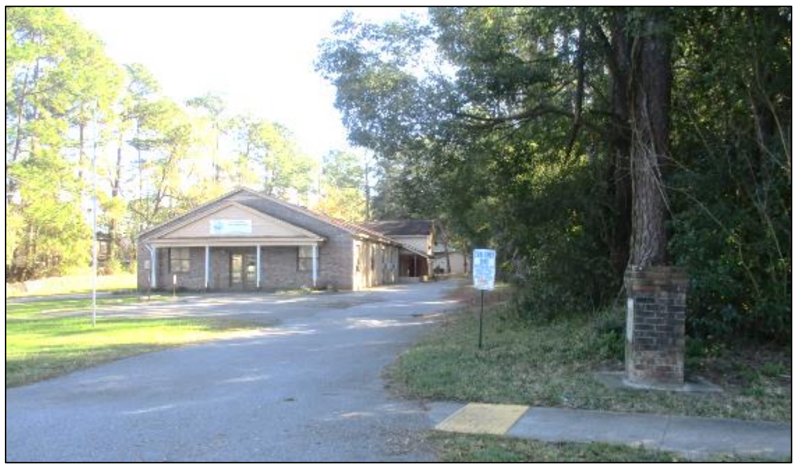
View of Property to the North February 3, 2020