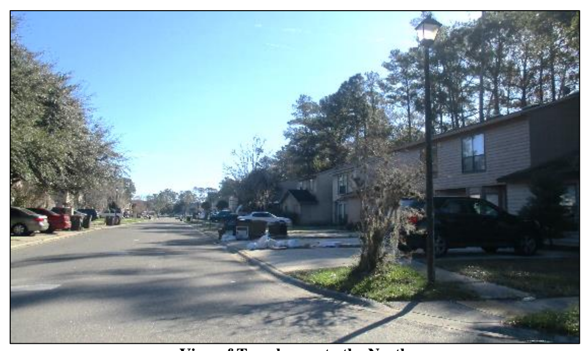
View of Townhomes to the North February 3, 2020