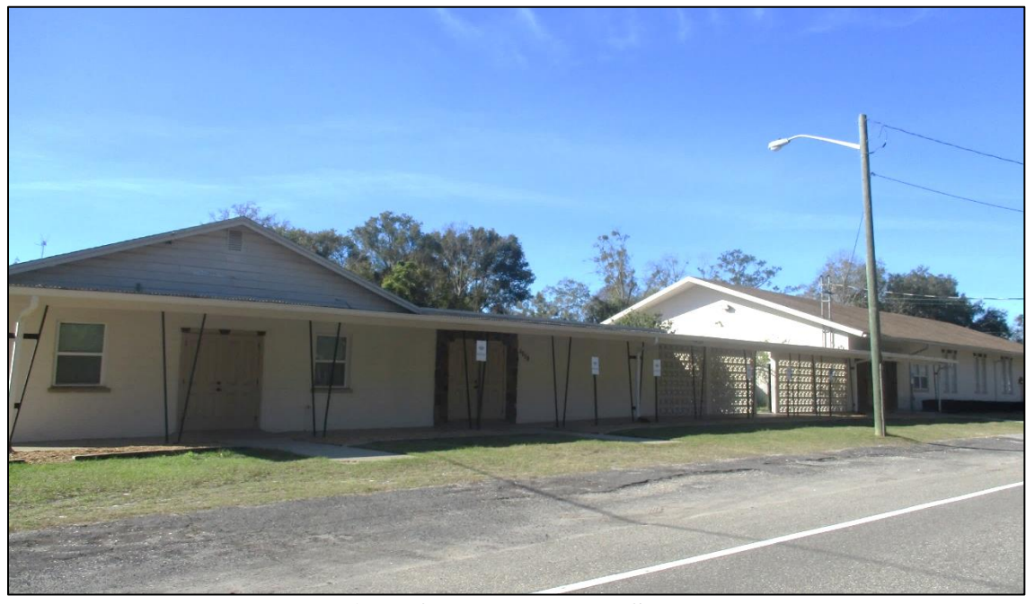
View of Property to the South February 3, 2020