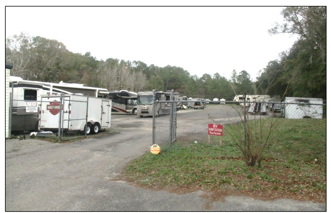
View of RV Storage Area Source: Planning & Development Department 01/14/2020