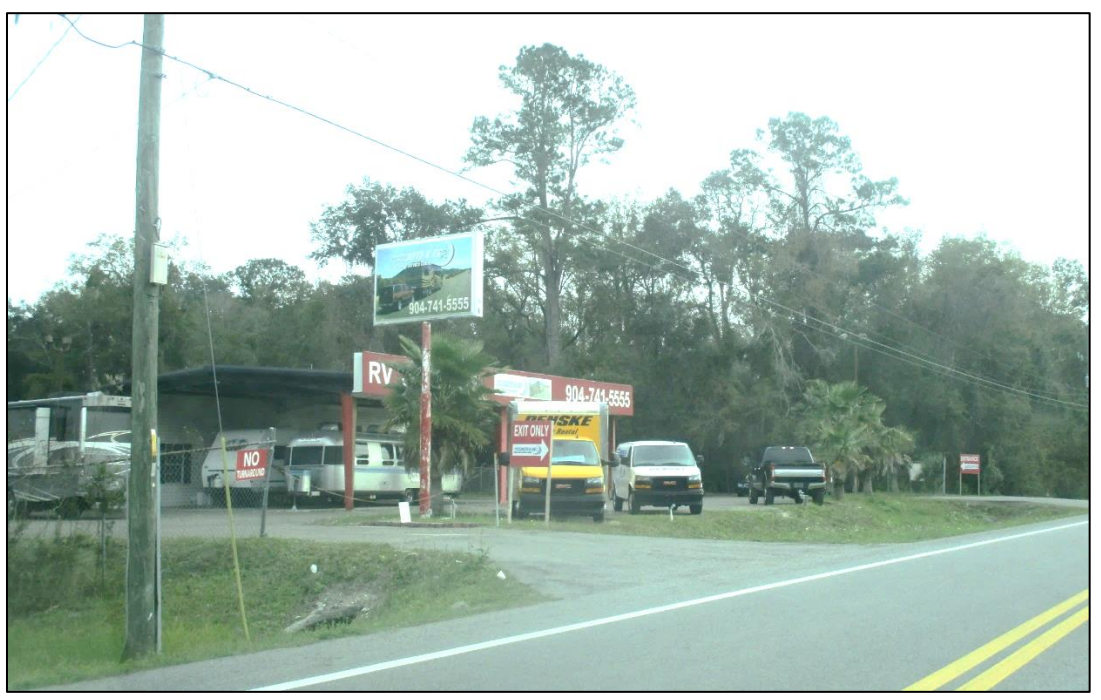
View of Subject Property Source: Planning & Development Department 01/14/2020