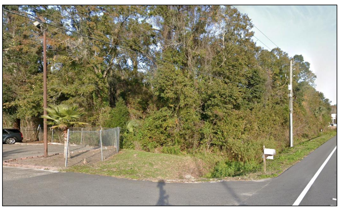
View of Properties to the East Source: Planning & Development Department 01/14/2020