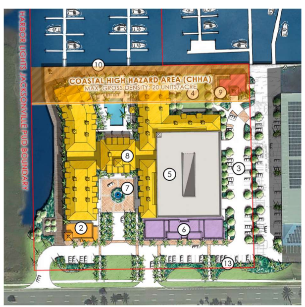
CHHA Boundary Map

Any other factor deemed relevant to the limitation of the intensity of the development for the benefit of the public health, welfare and safety: Staff also notes that approximately 3.77 acres of the subject site is located within a Coastal High Hazard Area (CHHA), as defined by Sections 163.3178(2)(h) and 163.3164(1), Florida Statutes. Density within the portion of the subject site that is designated CGC and is within the CHHA shall be 20 units/acre. As such, the boundaries of the CHHA are delineated on the site plan below: