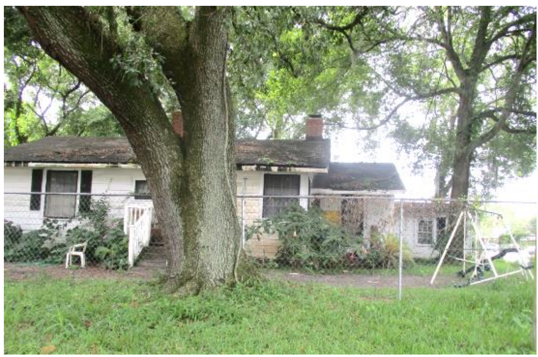
View of Property to the North 08/20/2019