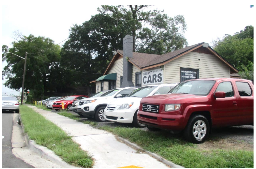
View of Subject Property 08/20/2019