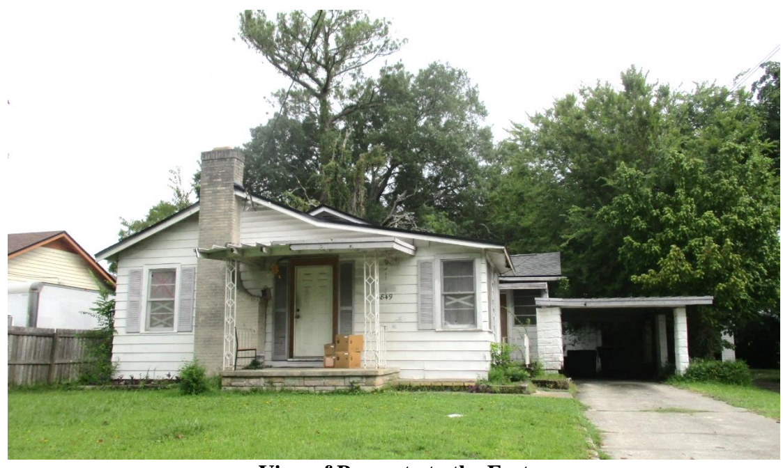
View of Property to the East Source: Planning & Development Department 08/20/2019