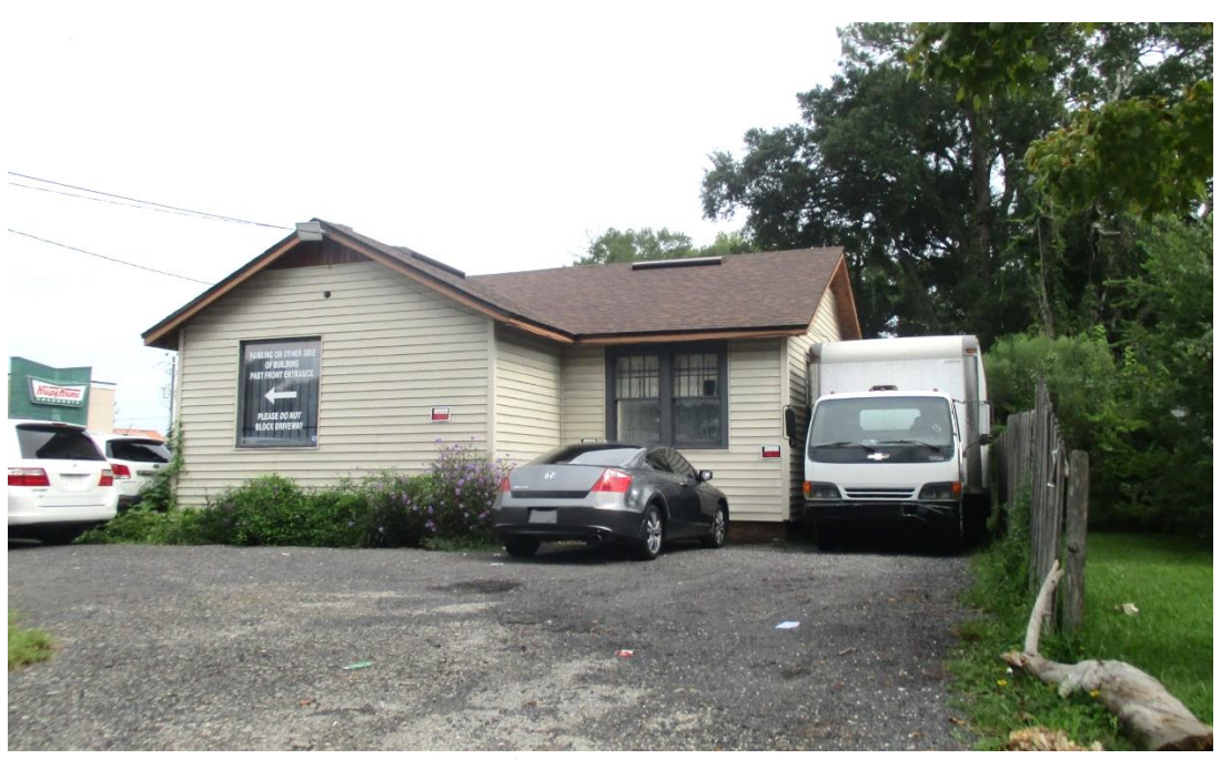
View of East Property Line Source: Planning & Development Department 08/20/2019