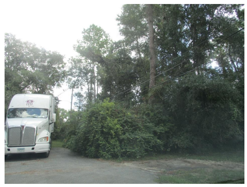
View of the subject property along Salk Ave.

Date: September 9, 2019