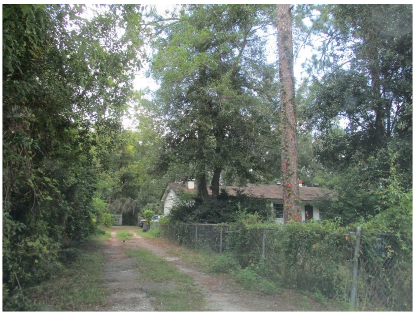
View of the subject property along Salk Ave.

Date: September 9, 2019