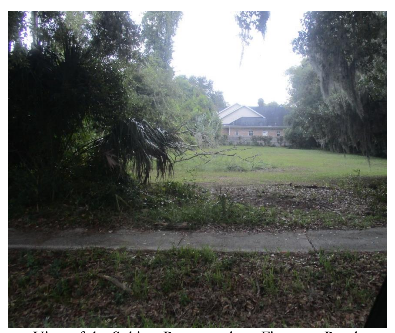
View of the Subject Property along Firestone Road.

Date: September 9, 2019