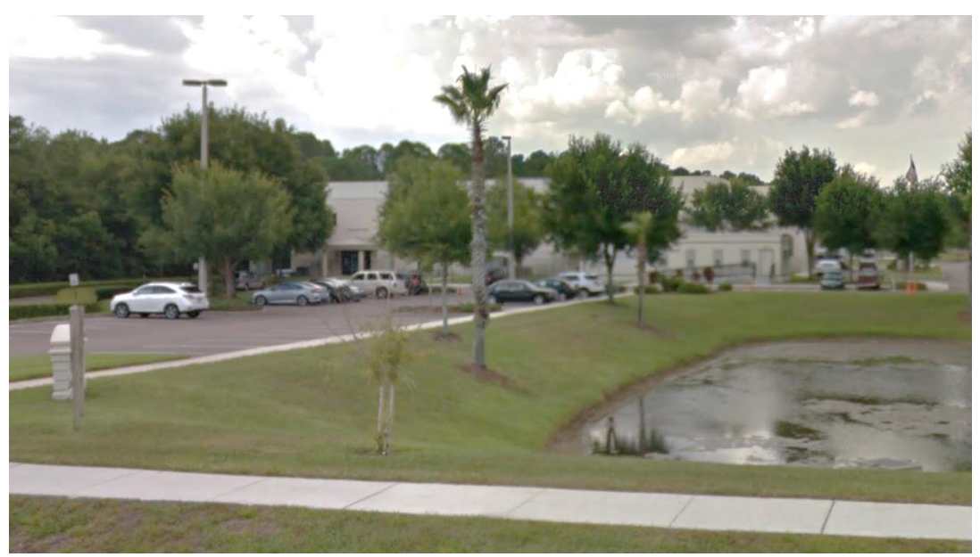
Property to the South Source: Planning & Development Department 08/20/2019