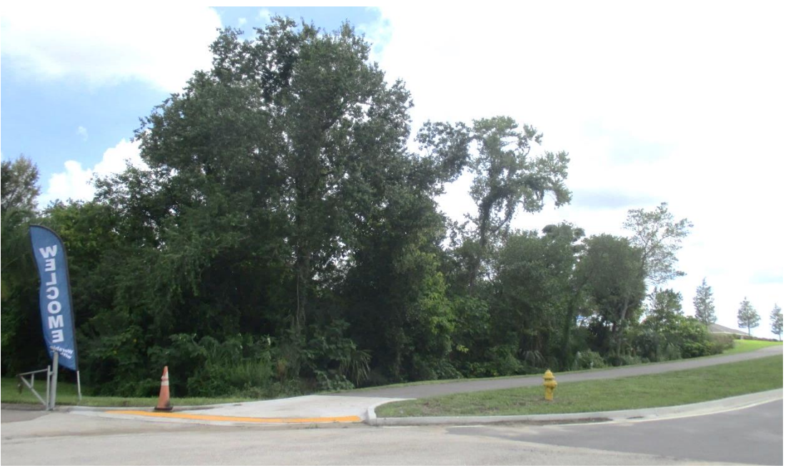
Entrance from Lone Star Road to Subject Property Source: Planning & Development Department 08/20/2019