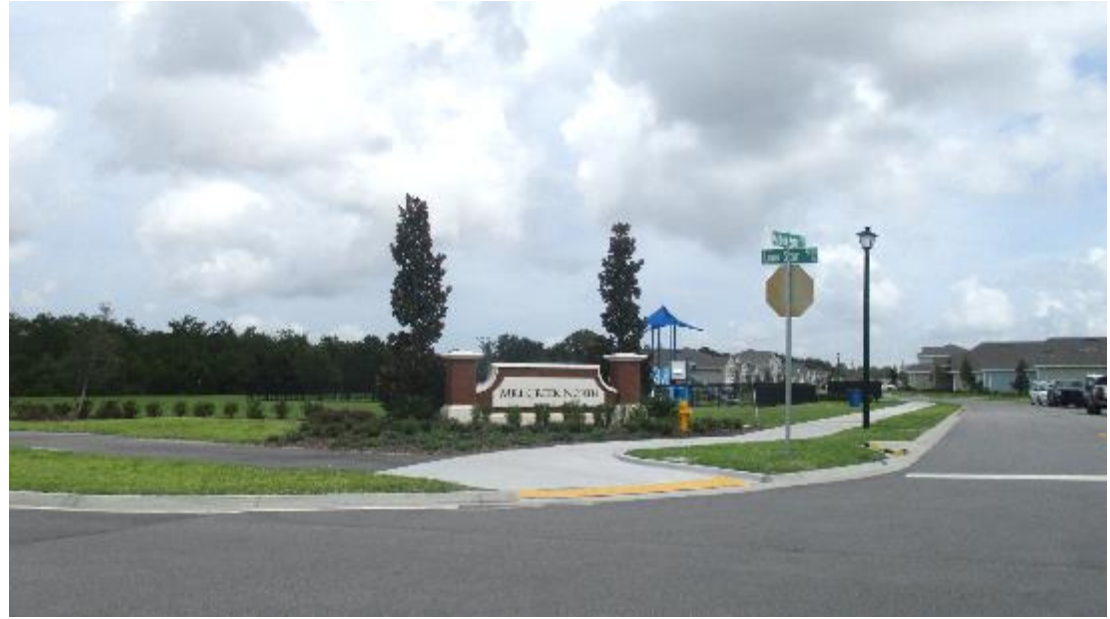
View of Properties to the East Source: Planning & Development Department 08/20/2019