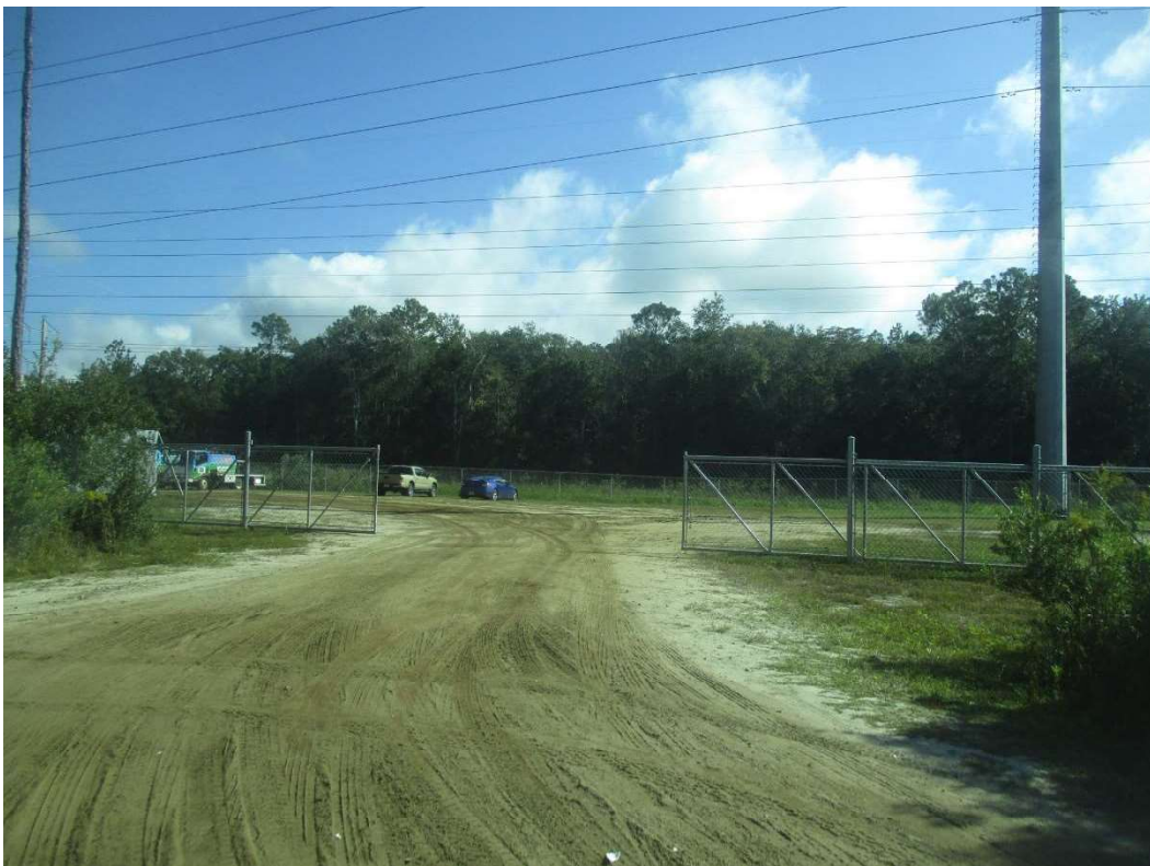
View of the Utsey Road Site with the Moncrief Road Property (Tree Line) In the background