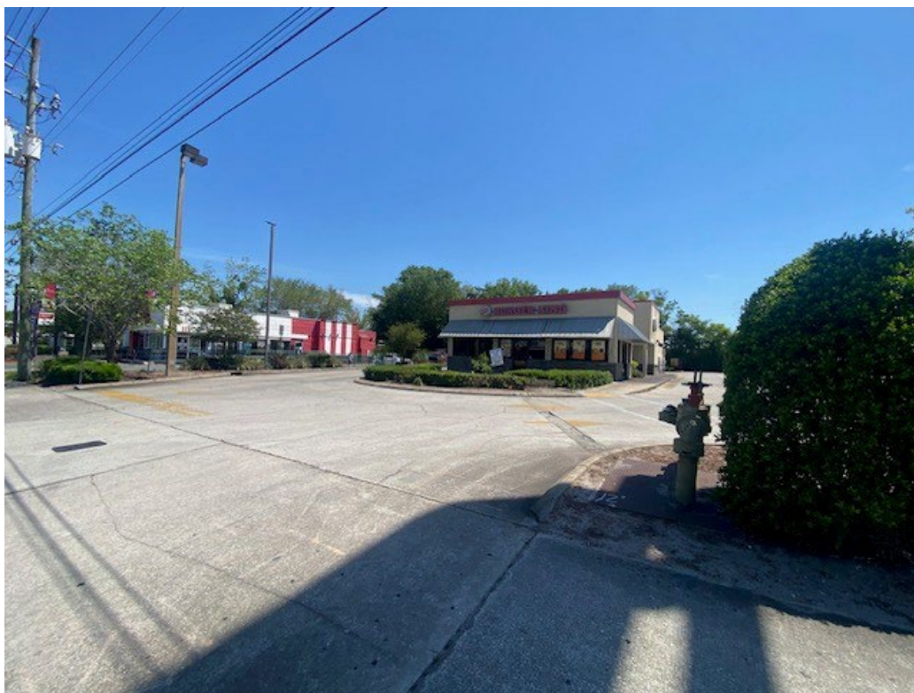
View of subject property.