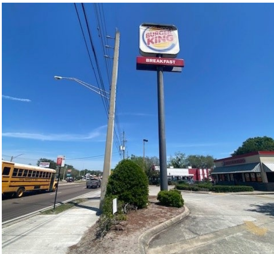
View of sign location.