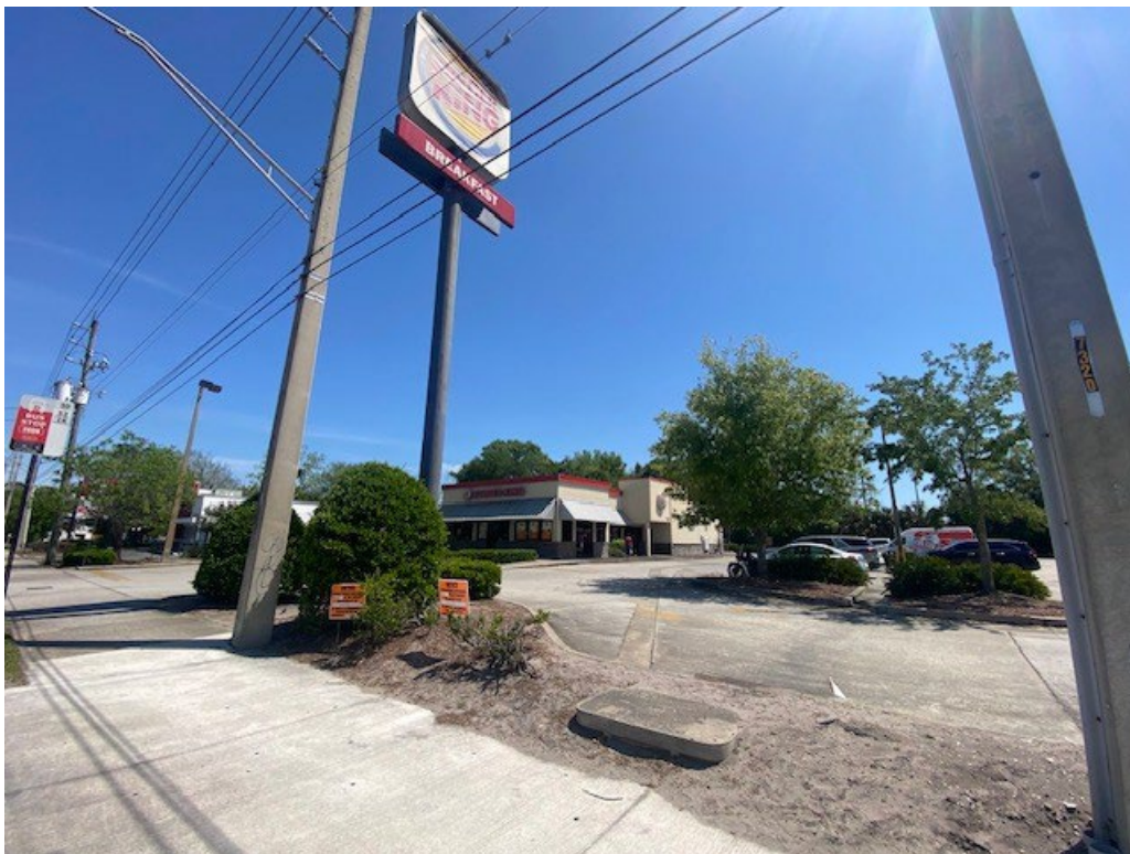
View of subject property.