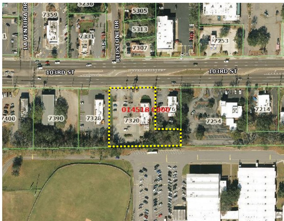
Aerial view of subject property.