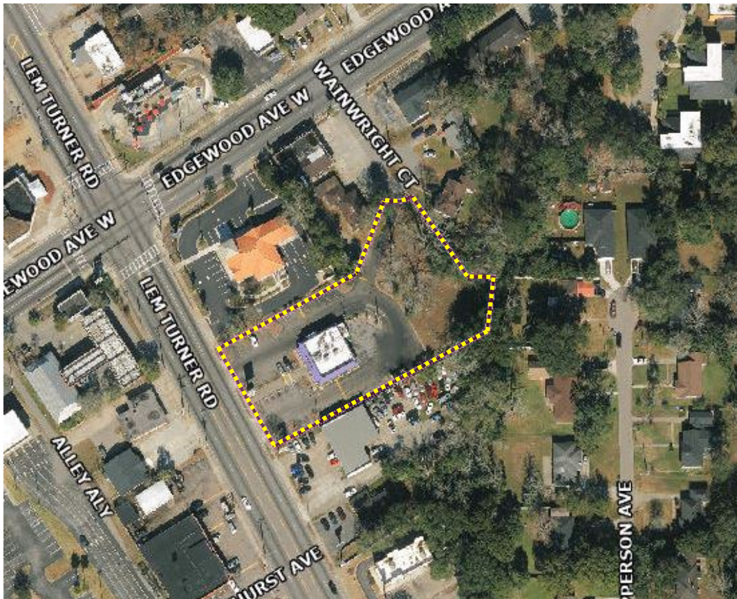
Aerial view of the subject site.