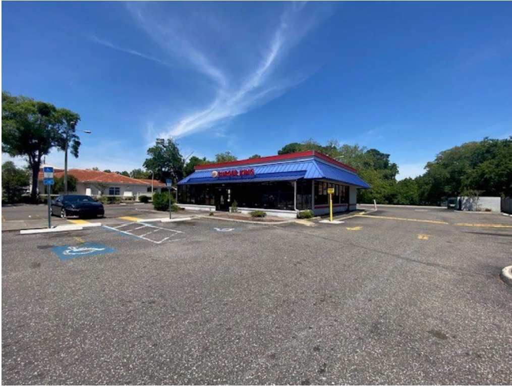
View of the subject property.