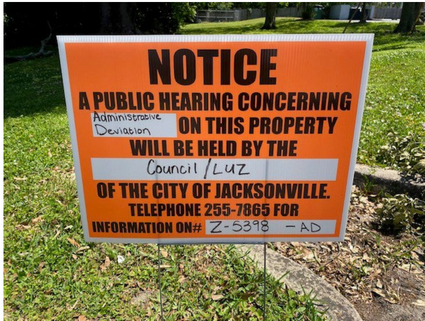
The Notice of Public Hearing signs were posted.