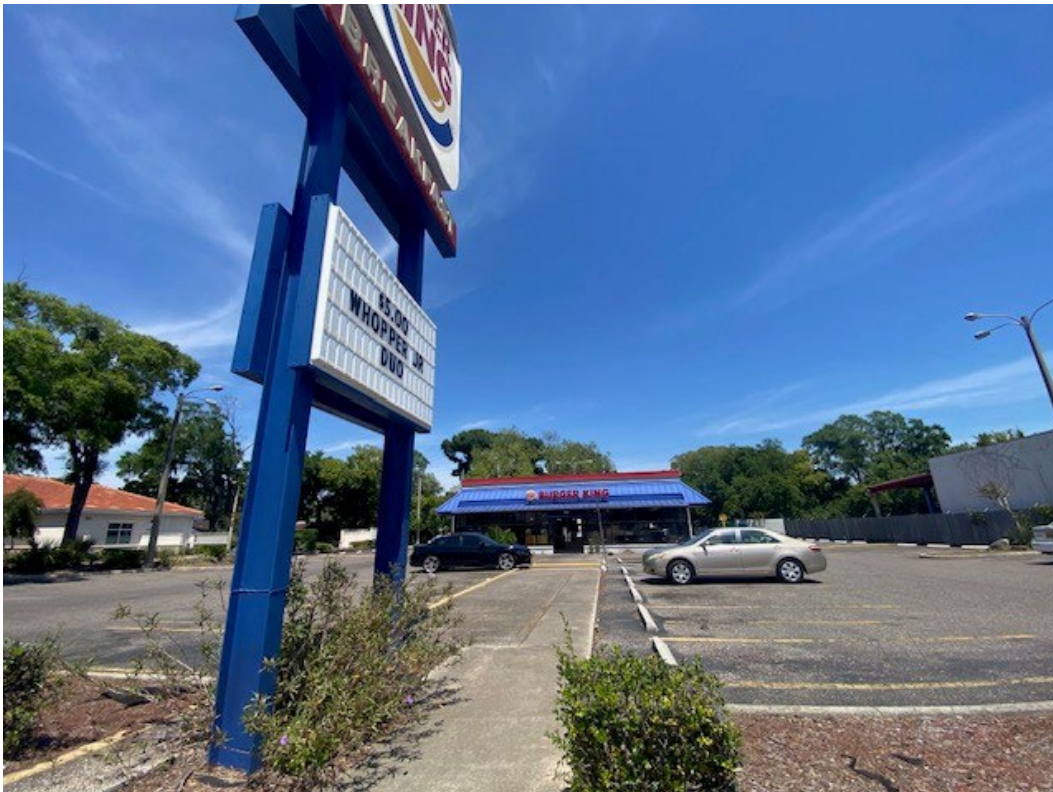
View of the subject property Lem Turner Road.