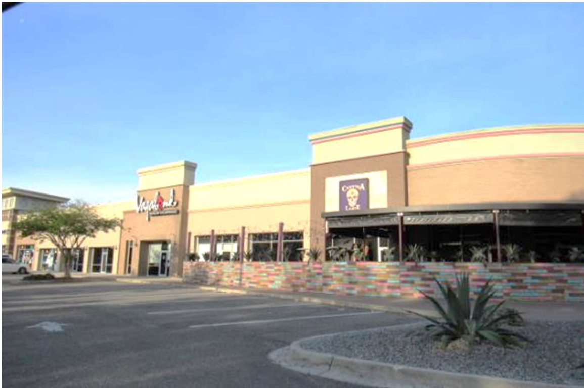
View of subject property