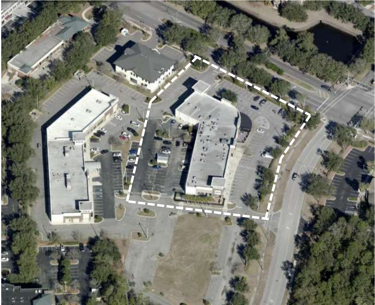
Aerial View of Subject Property.

Based on the foregoing, it is the recommendation of the Planning and Development Department that Ordinance 2024-238 (E-24-13) be APPROVED .