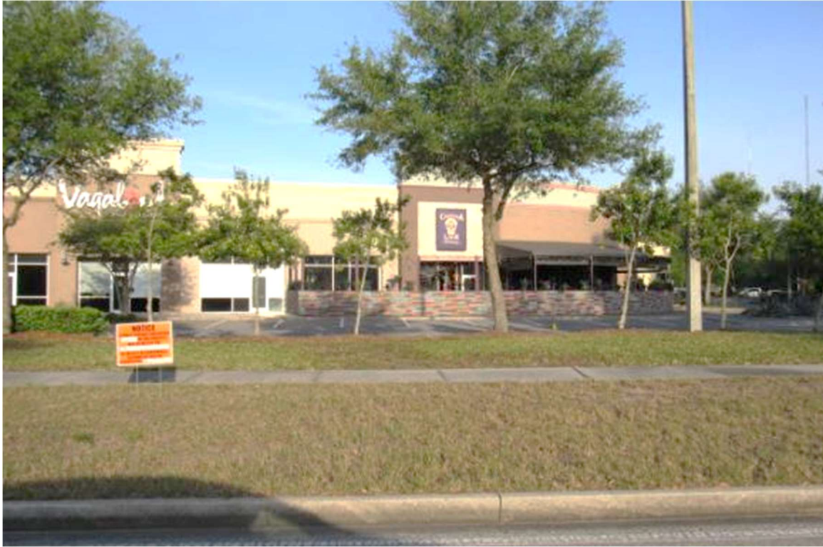
View of subject property