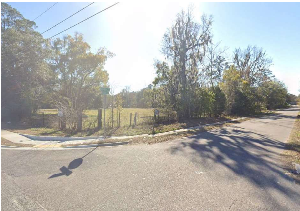
View of the Subject Site from the corner of Francis Road and Cleveland Road