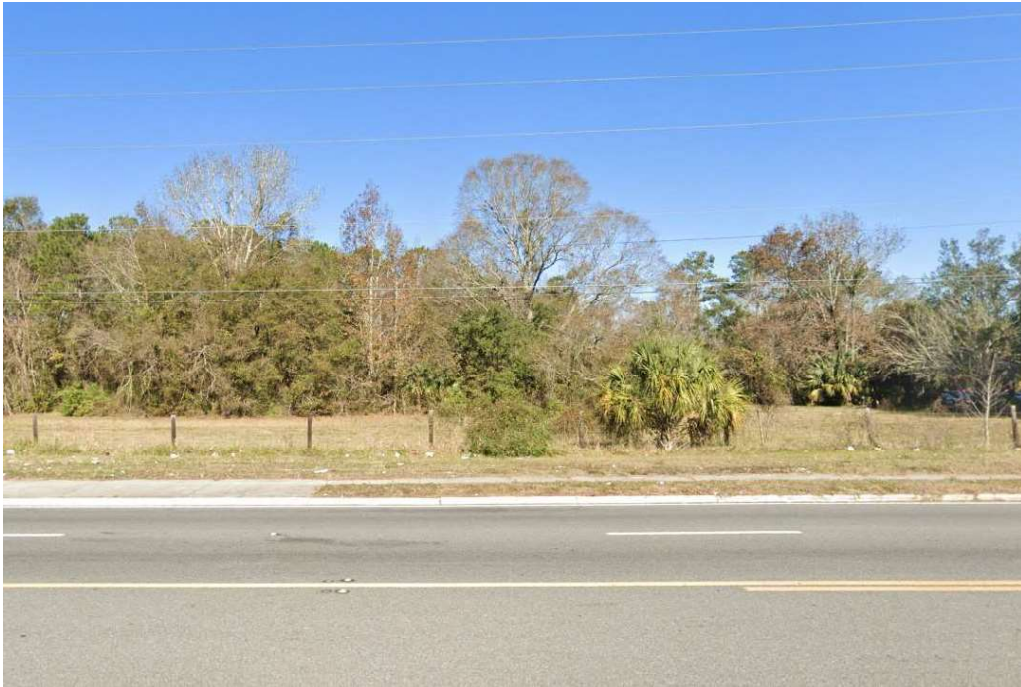
View of the Subject Site from Edgewood Avenue