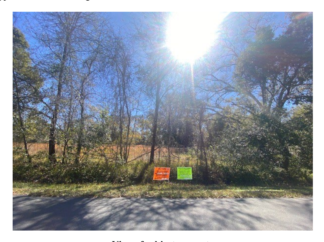
View of subject property

Based on the foregoing, it is the recommendation of the Planning and Development Department that Application for Rezoning Ordinance 2024-0057 be APPROVED.