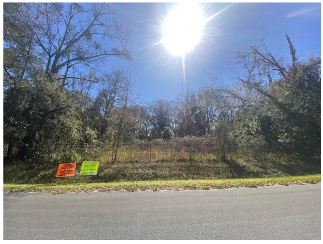
View of subject property.