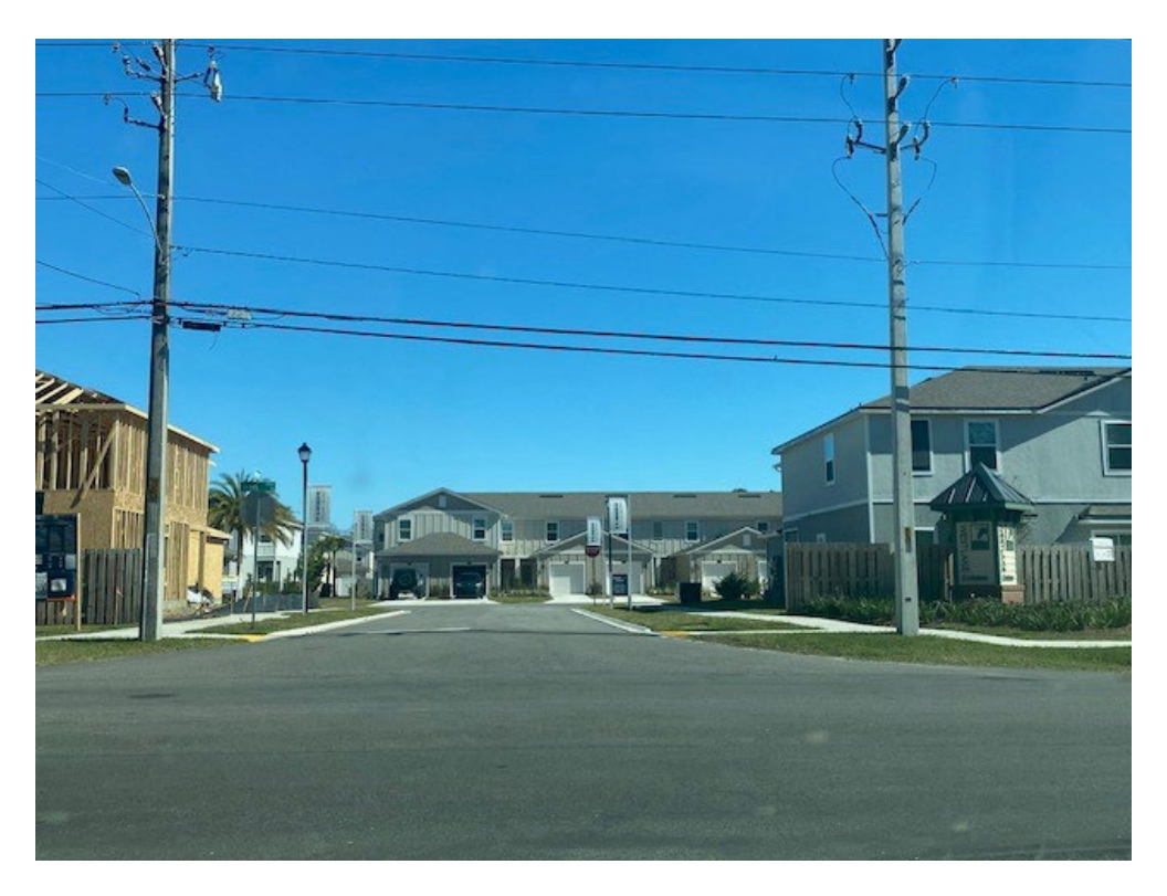
View of subject property developed with townhomes to the east.