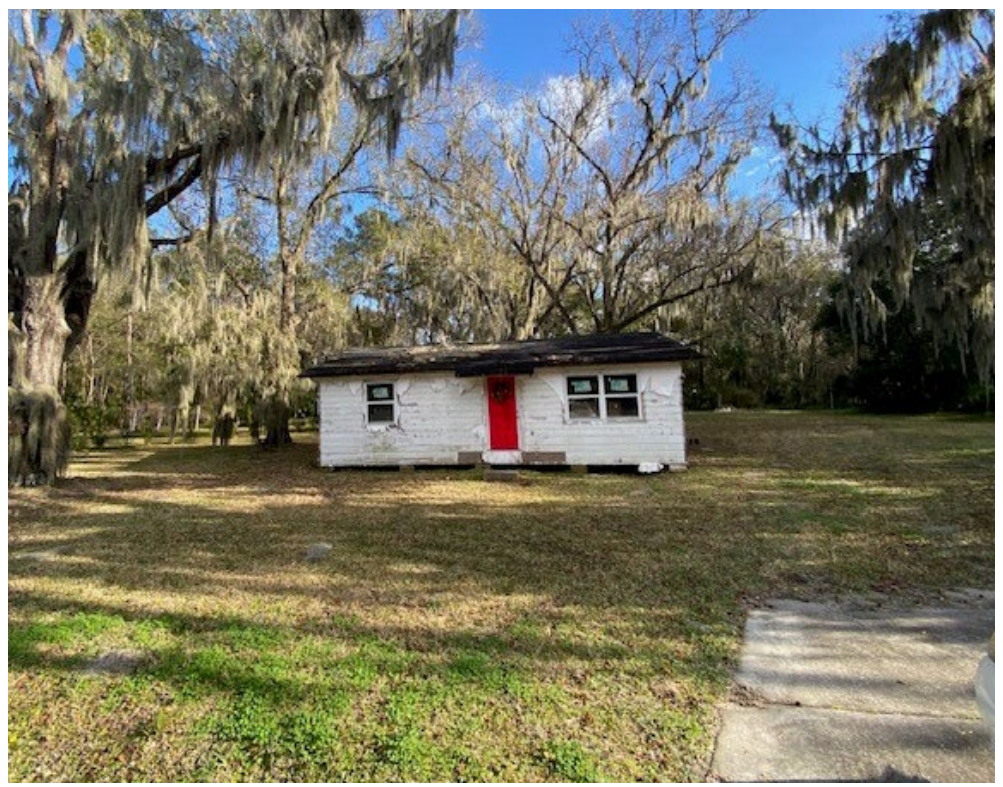
View of the subject property.