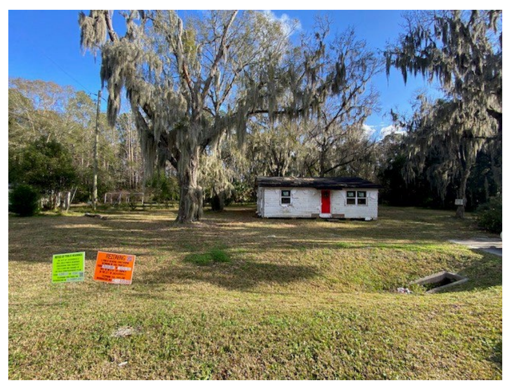
View of dwelling on subject property.