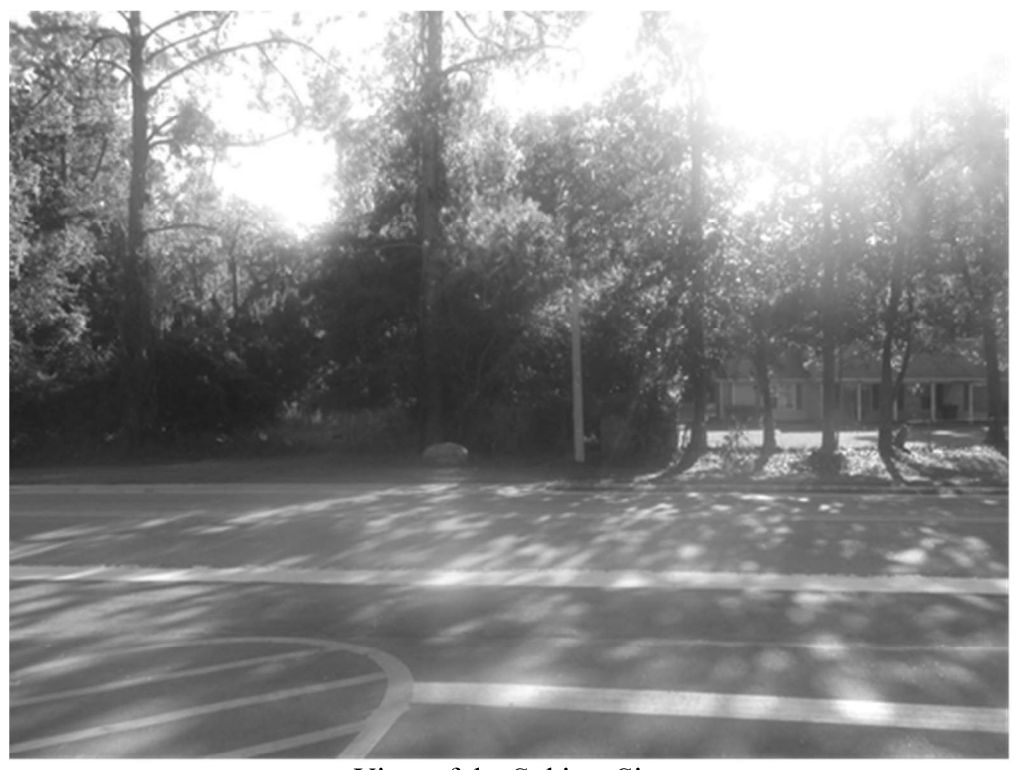
View of the Subject Site