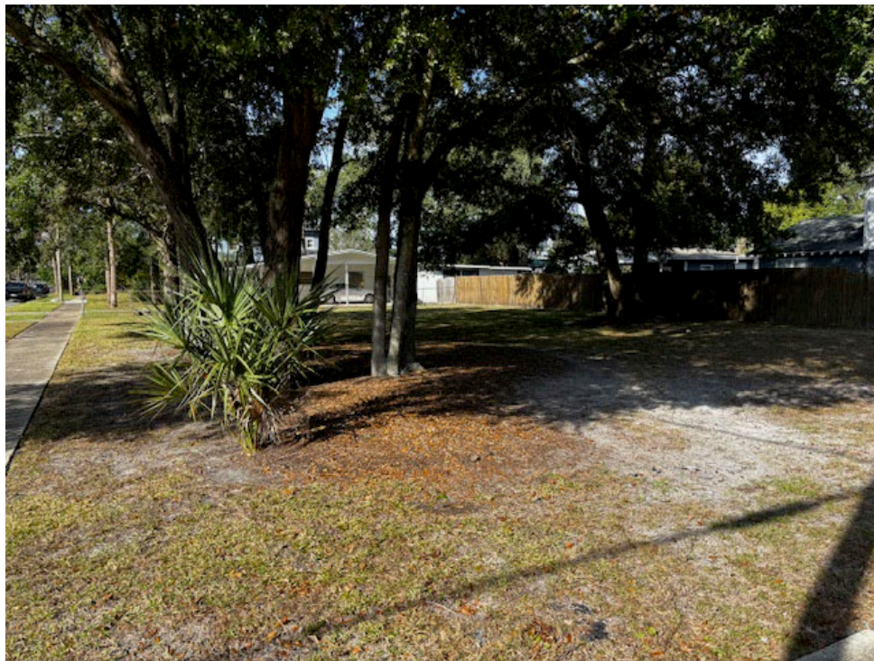
View of Subject Lot Source: Planning & Development Department (11/30/2023)