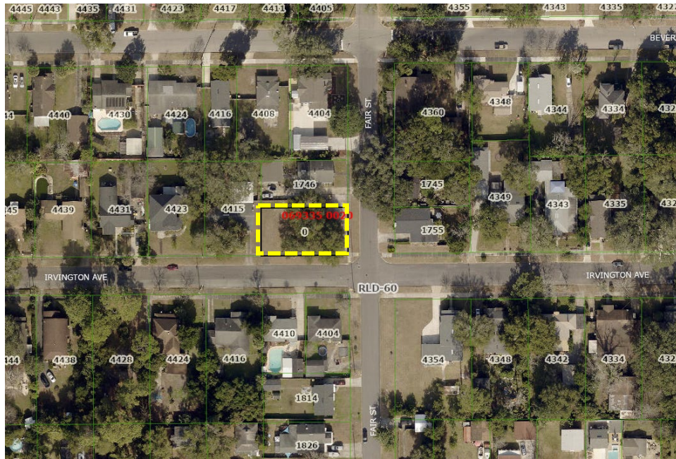
Aerial View