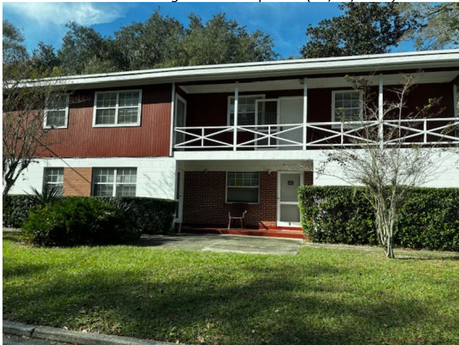
View of Nearby multifamily property

Source: Planning and Development (11/30/2023)