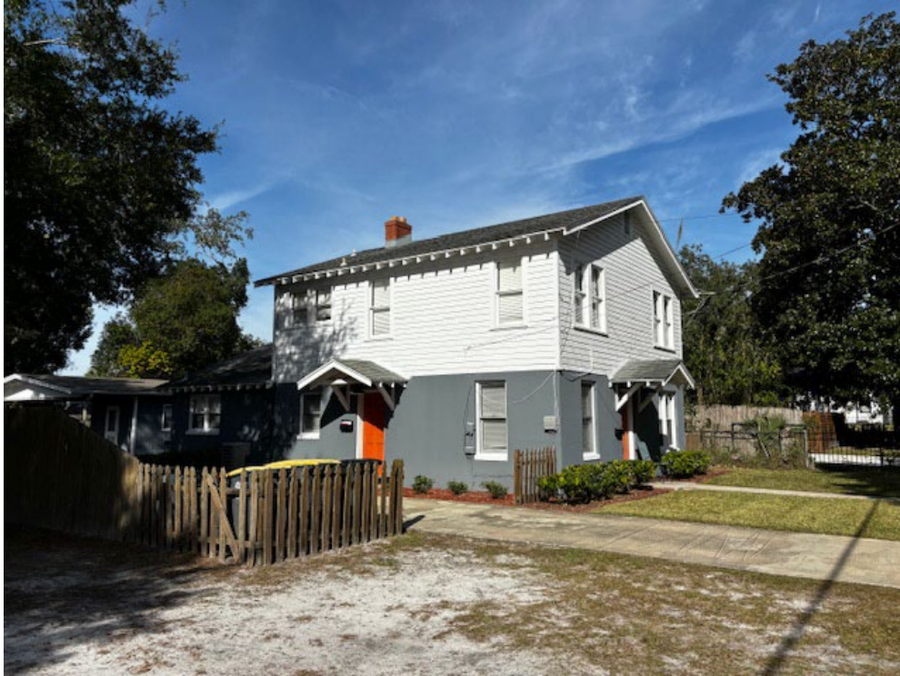
View of adjacent multifamily property