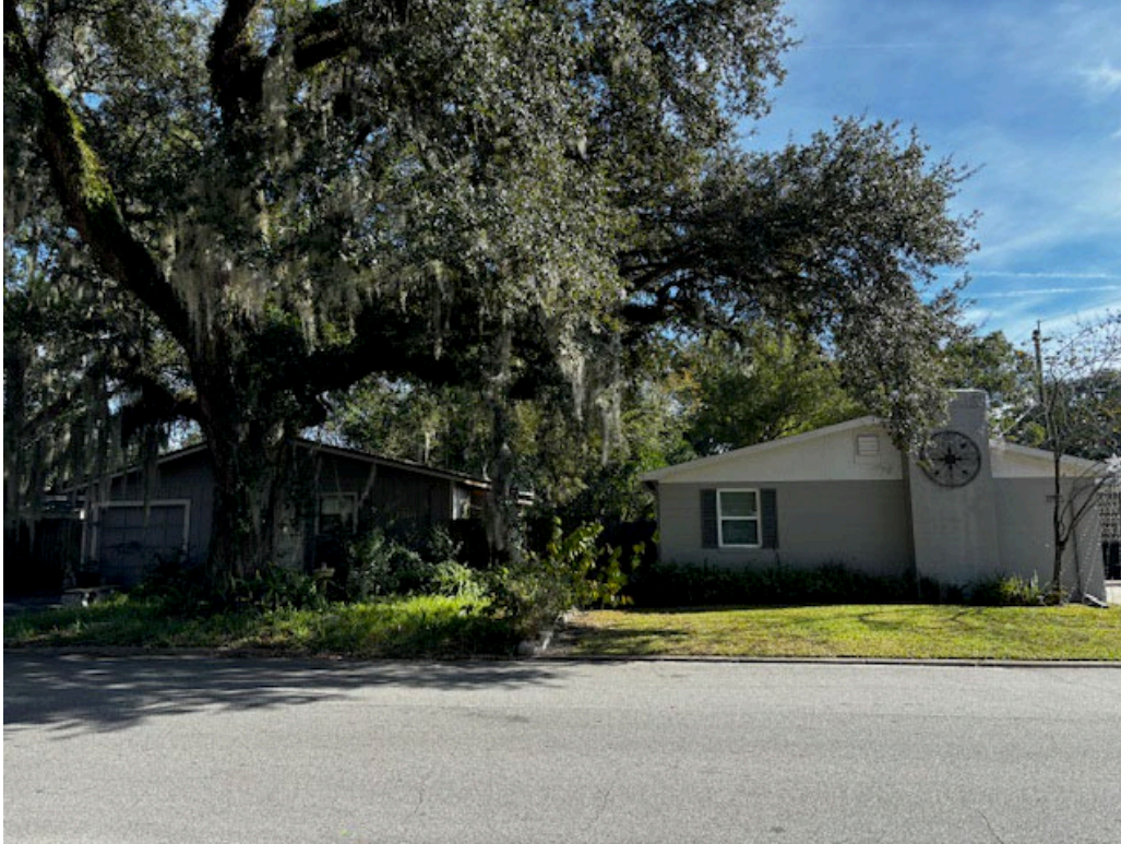
View of nearby single family homes