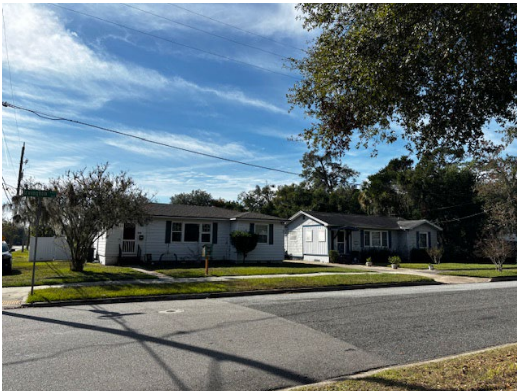
View of nearby single family homes

Source: Planning & Development Department (11/30/2023)