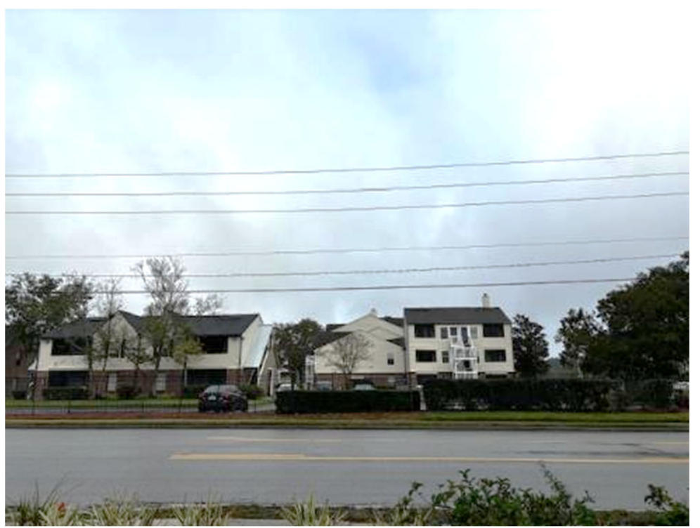
View of Nearby Apartment Complex to the North of the Subject Property Source: Planning and Development Department November 17, 2023