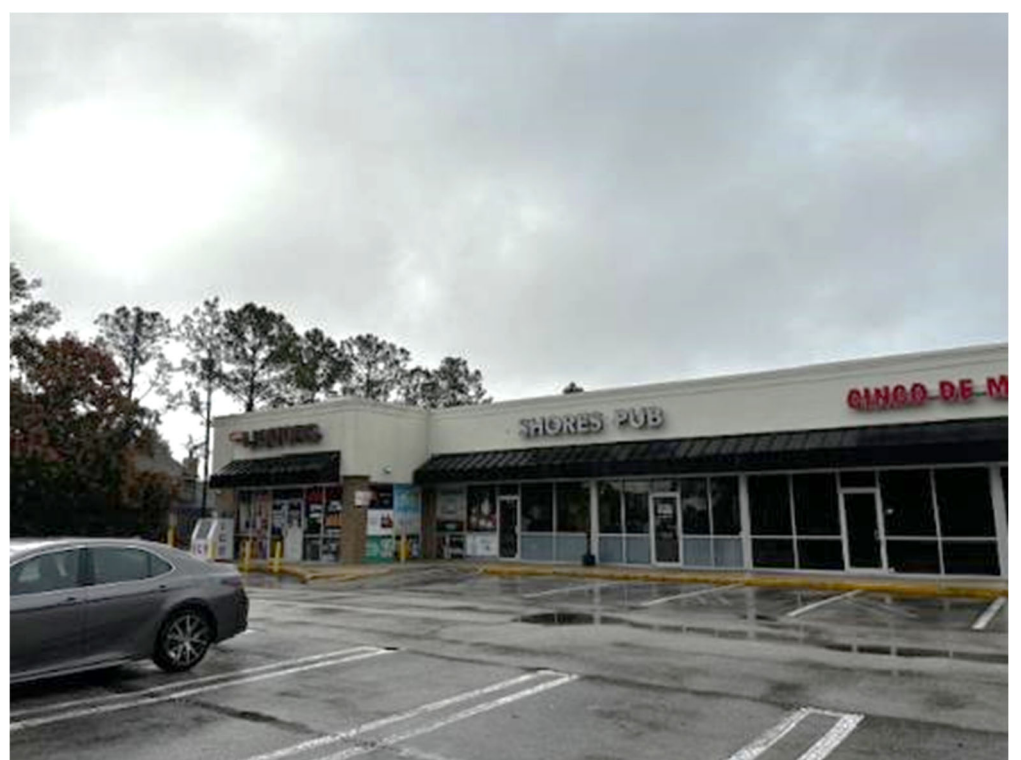
View of Adjacent Pub Serving all Alcohol Source: Planning and Development Department November 17, 2023