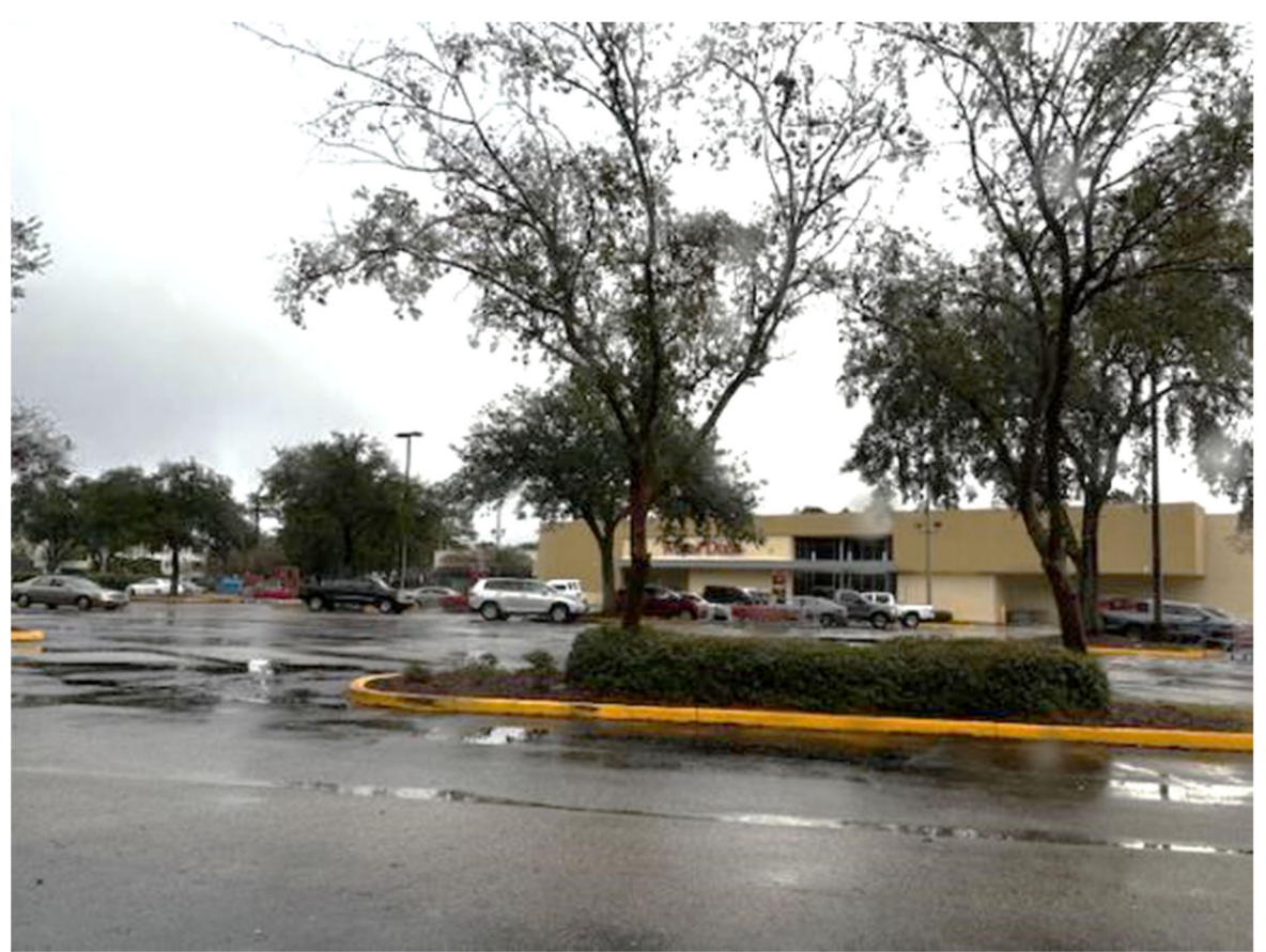
View of Adjacent Retail Shopping Center November 17,2023