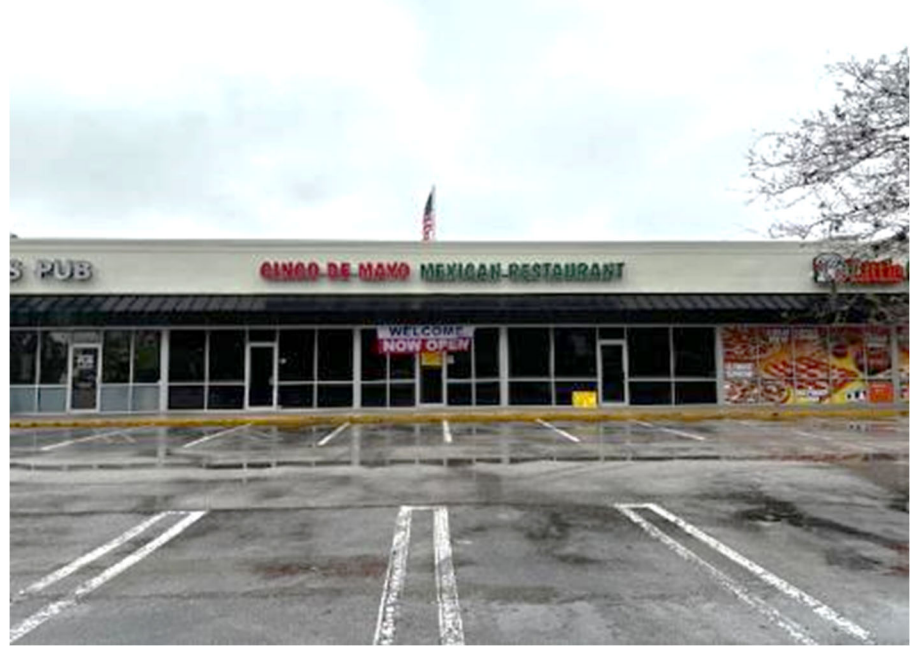
View of Subject Restaurant Seeking Exception November 17, 2023