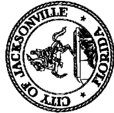
Exhibit 2 (Page 1 of 1)