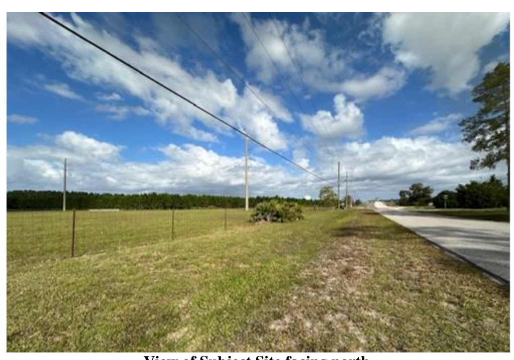
View of Subject Site facing north. Source: Planning & Development Department, 10/24/2023