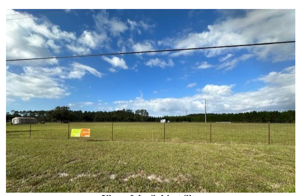
View of the Subject Site