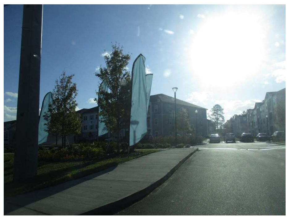
View of the apartment complex across Duval Road