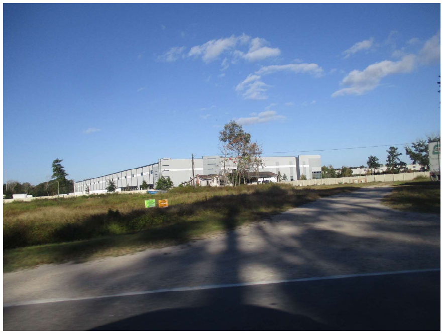
View of the Subject Site