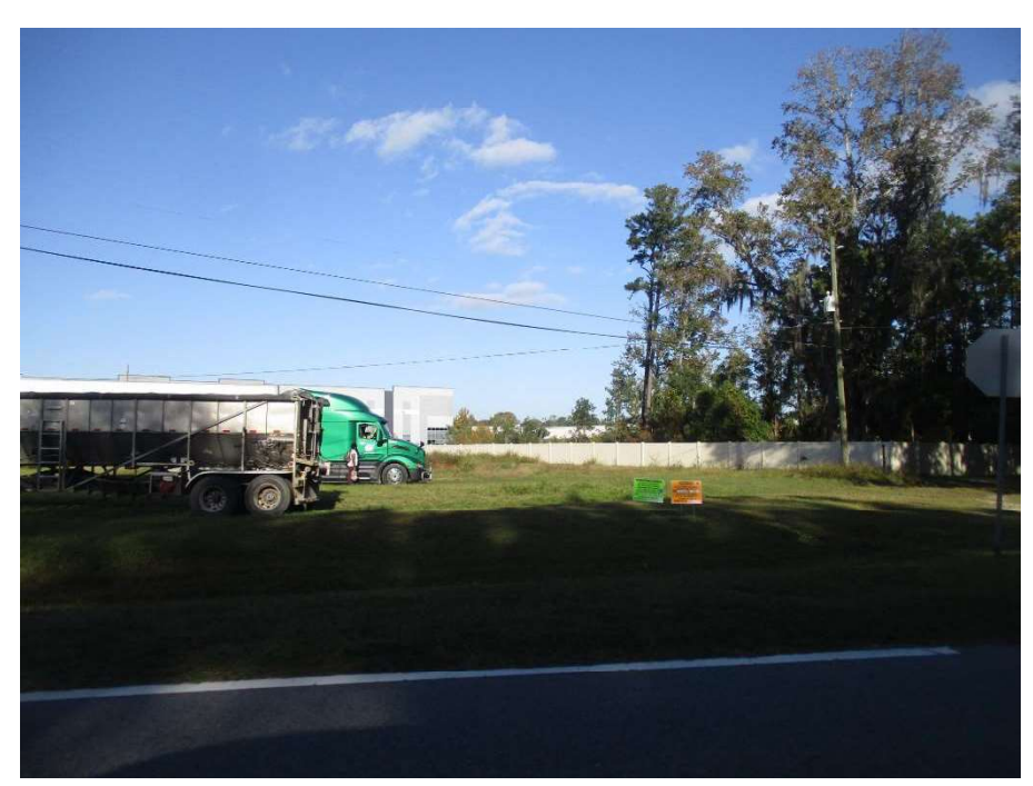
View of the Subject Site