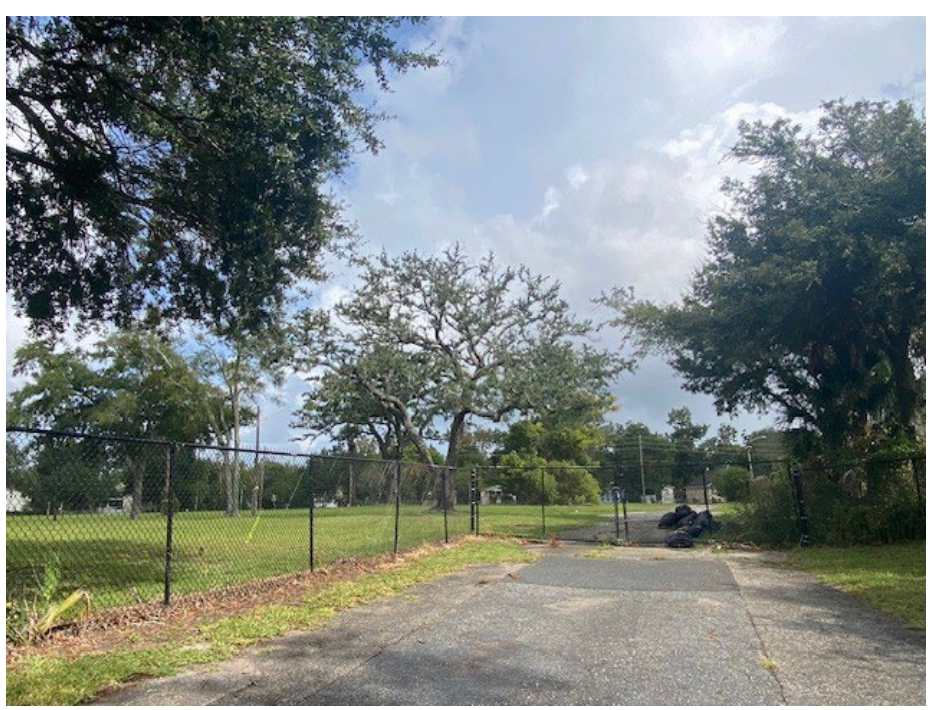
Source: Planning & Development Department, 10/04/2023 View of the subject property from Georgia Street road closure.