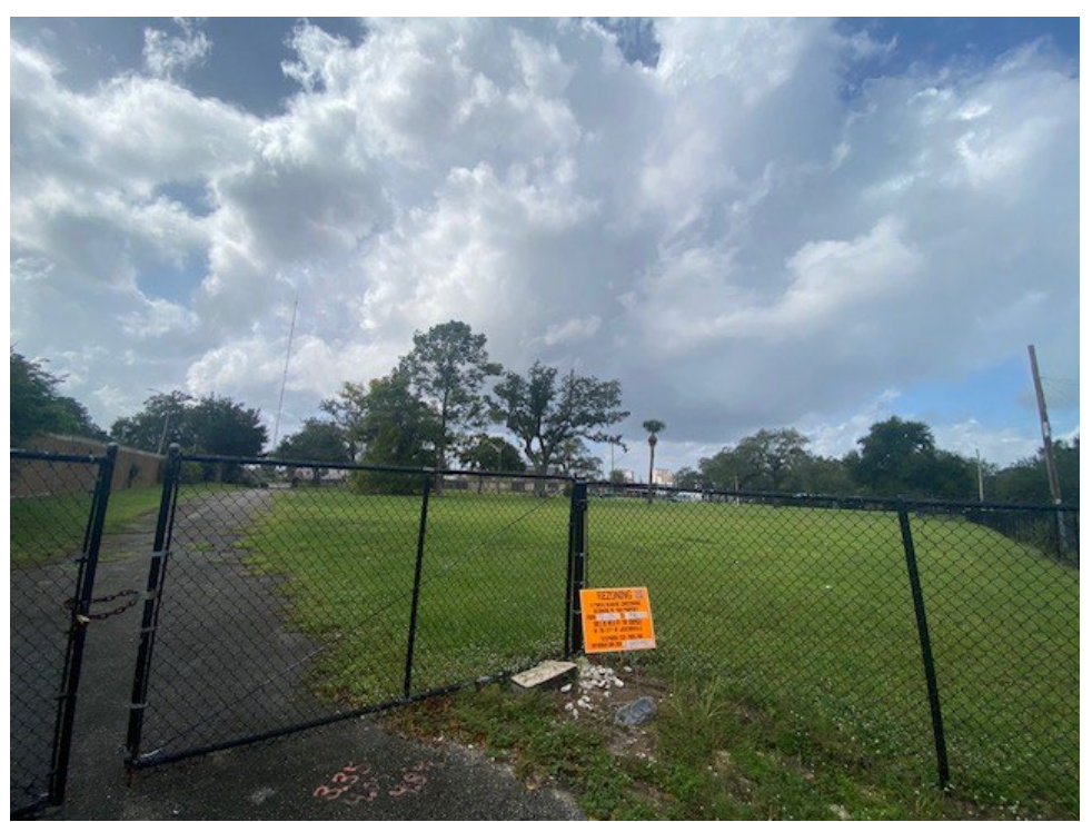
Source: Planning & Development Department, 10/04/2023 View of the subject property from Grant Street facing south.