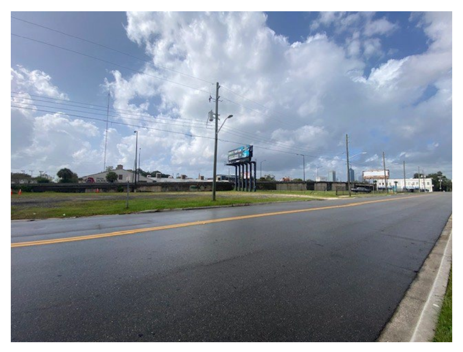
Source: Planning & Development Department, 10/04/2023 View of the subject property from Albert Street facing south.