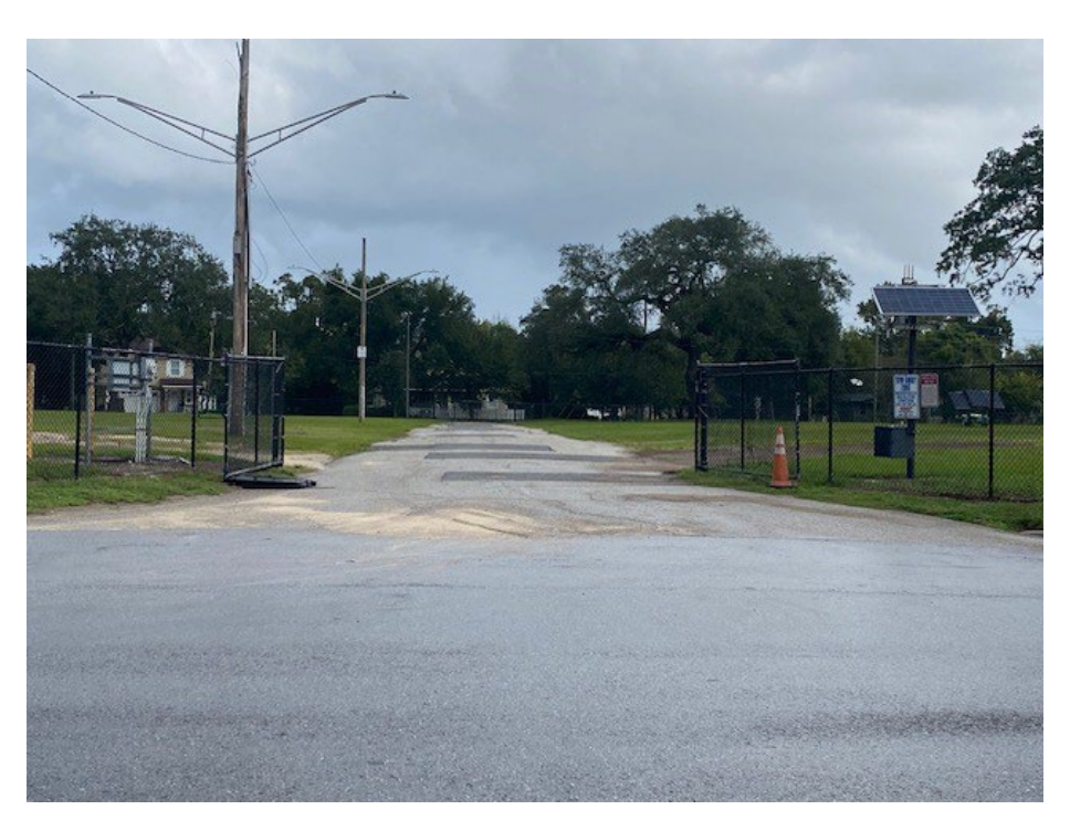
Source: Planning & Development Department, 10/04/2023 View of the subject property Van Buren Street road closure.