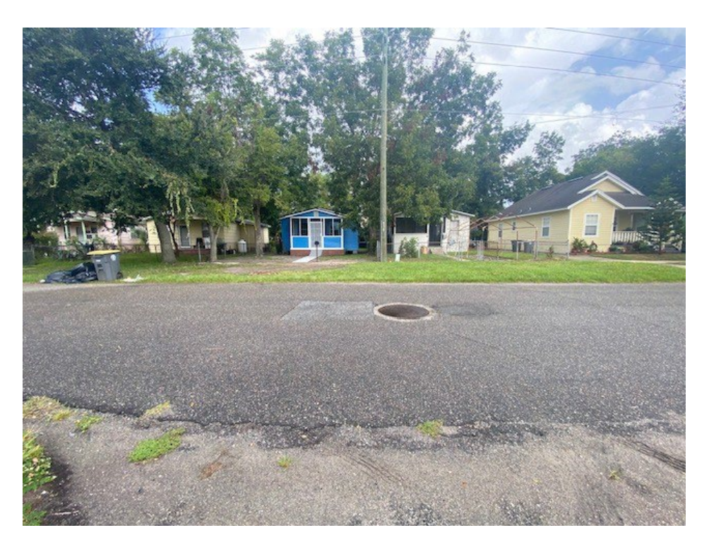
Source: Planning & Development Department, 10/04/2023 View of the one-story single family dwellings along Grant street facing north.