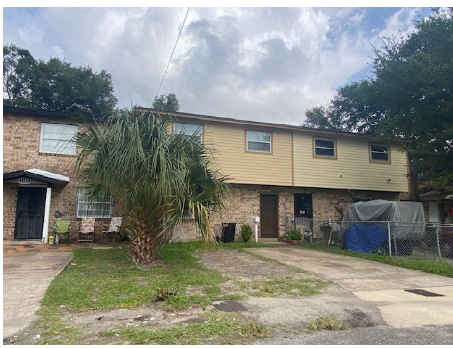
Source: Planning & Development Department, 10/04/2023 View of the two-story single family dwellings along Grant street facing north.