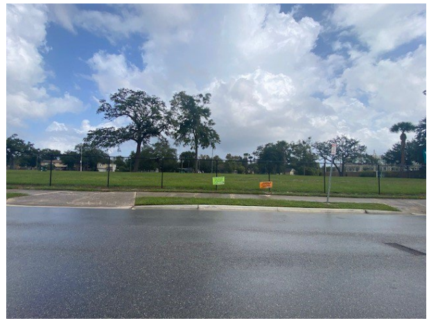
{\it Source: Planning \& Development Department, 10/04/2023} \\ {\it View of the subject property from Albert Street facing North.}