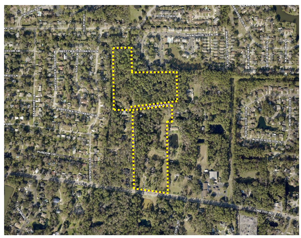
Source: Planning & Development Department, 09/19/2023 Aerial view of the subject property, facing north.