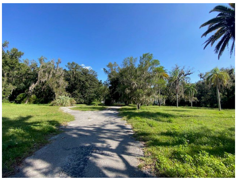
Source: Planning & Development Department, 09/19/2023 View of subject property.