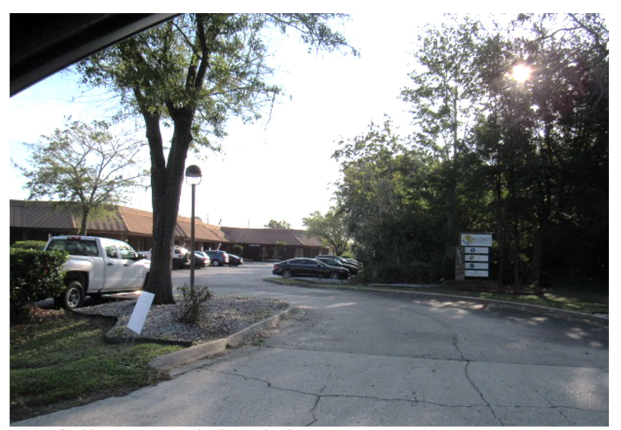
View of subject property and adjacent business