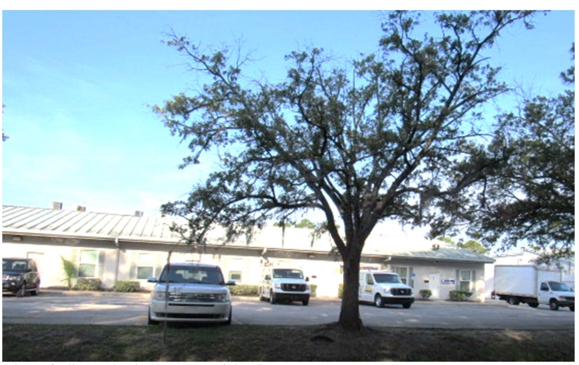
View of adjacent business across Richard Street,