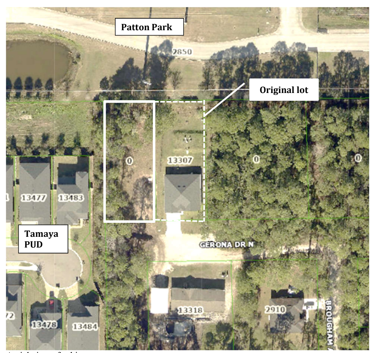
Aerial view of subject property