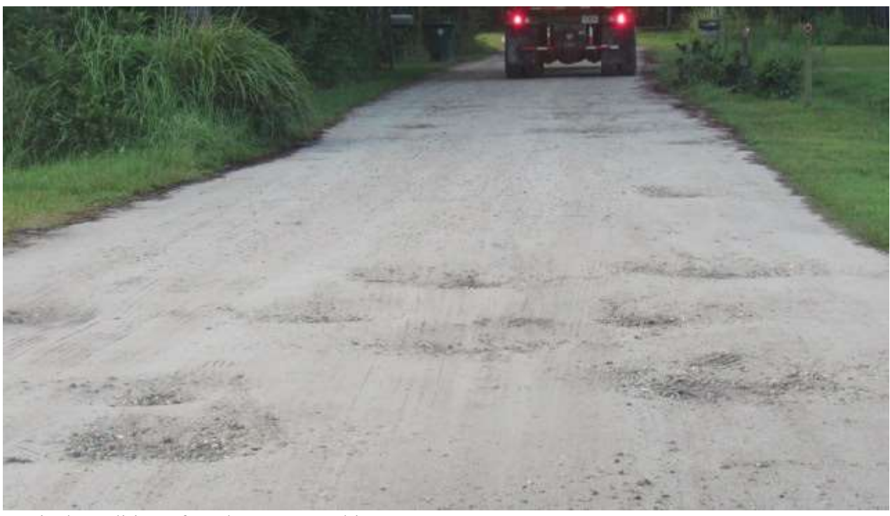
Typical condition of road to access subject property.