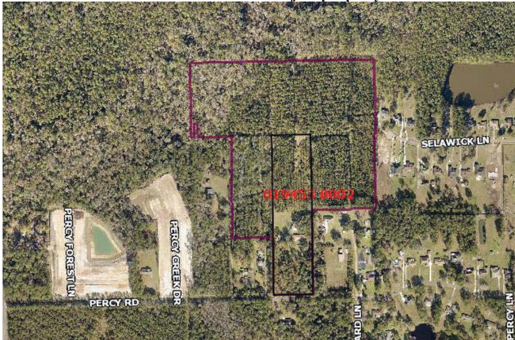
Aerial view of the subject property

Based on the foregoing, it is the recommendation of the Planning and Development Department that Application for Rezoning Ordinance 2023-0397 be DENIED .