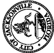
Exhibit 2 (Page 1 of 1)