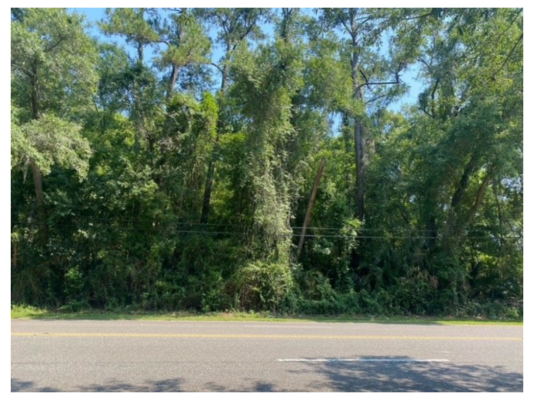
View of Subject Property from Lenox Avenue