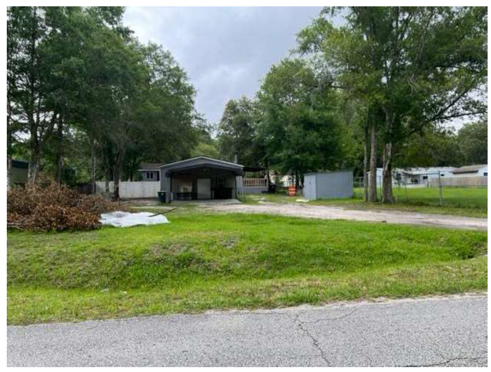
View of the Subject Site from Kevin Road