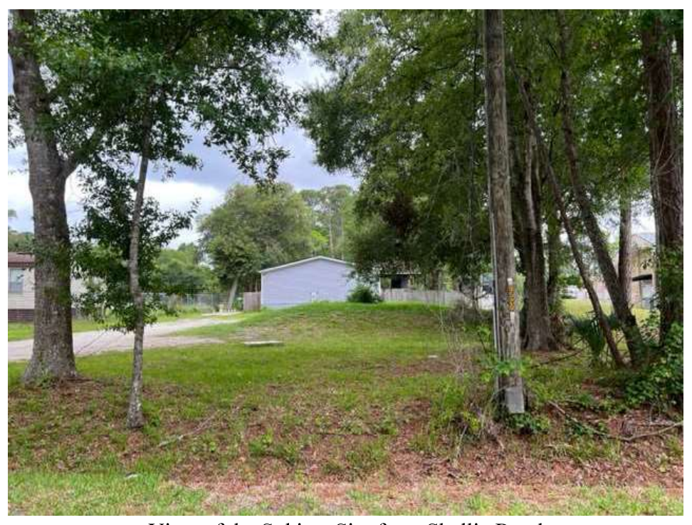
View of the Subject Site from Shellie Road