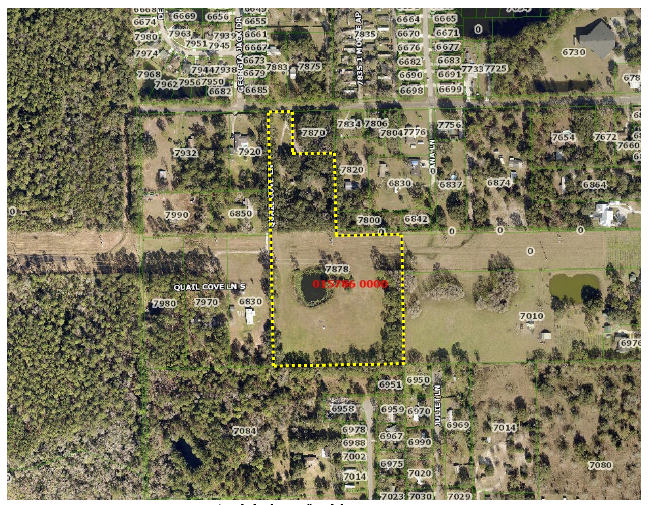
Aerial view of subject property.