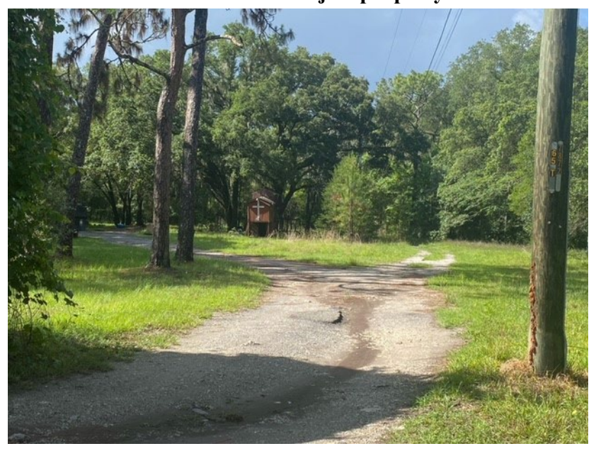
View of the Subject Property from Morse Avenue.