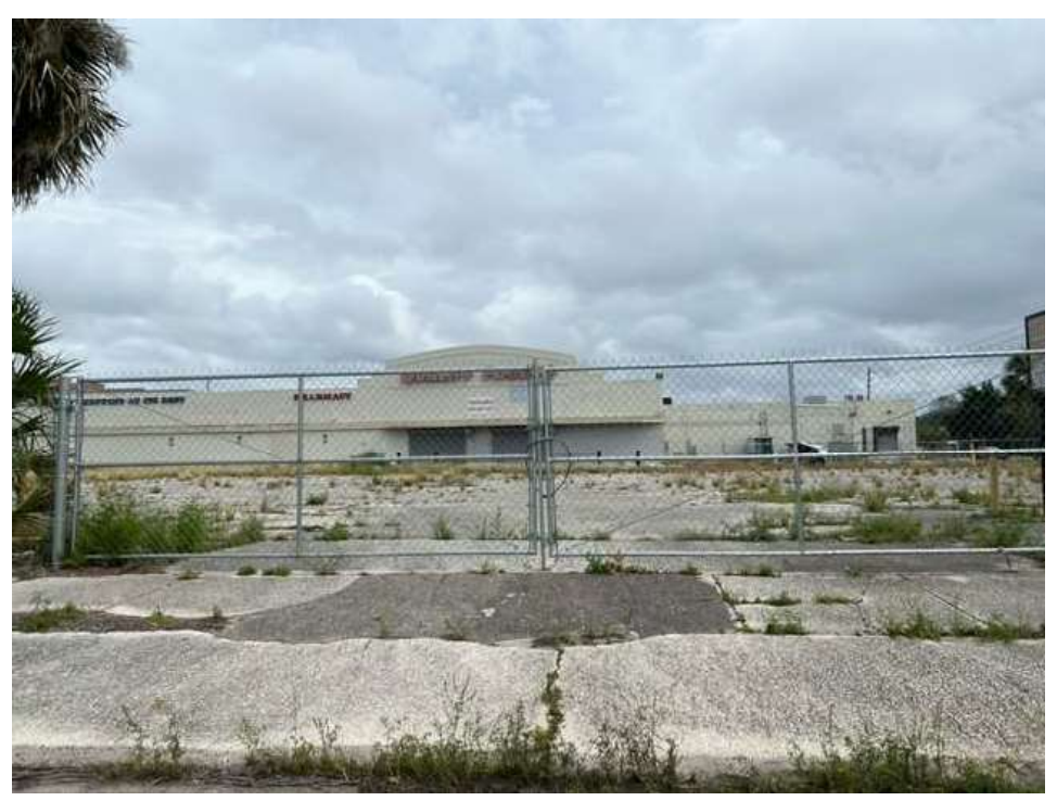
View of the Subject Site