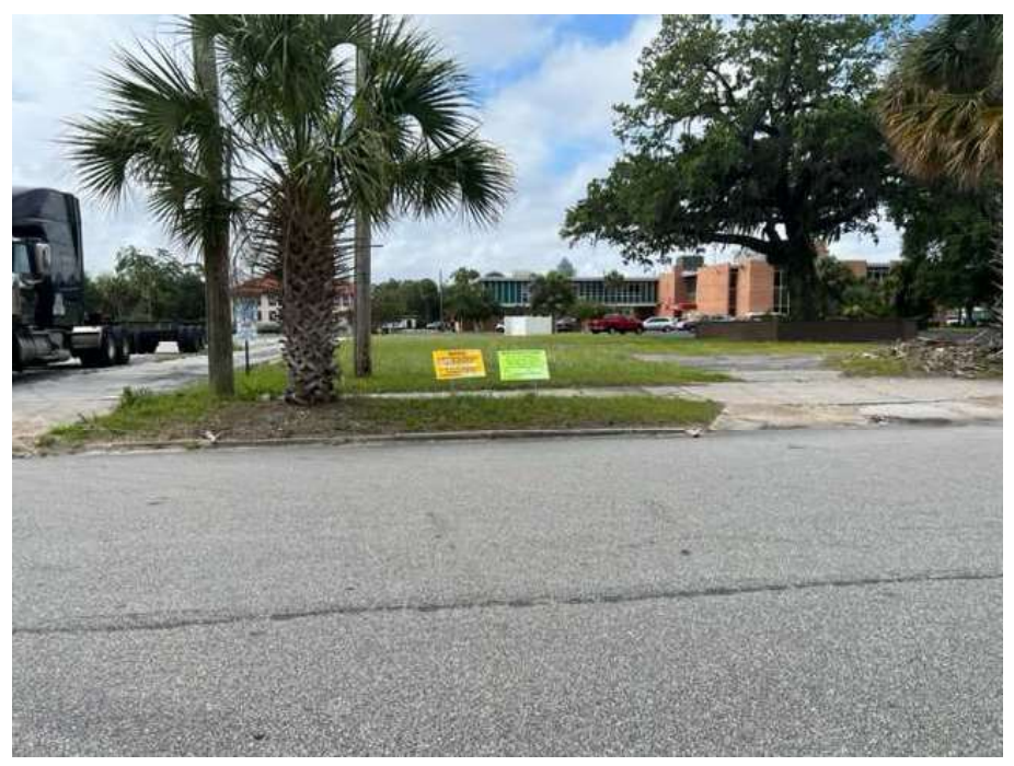
View of the Subject Site