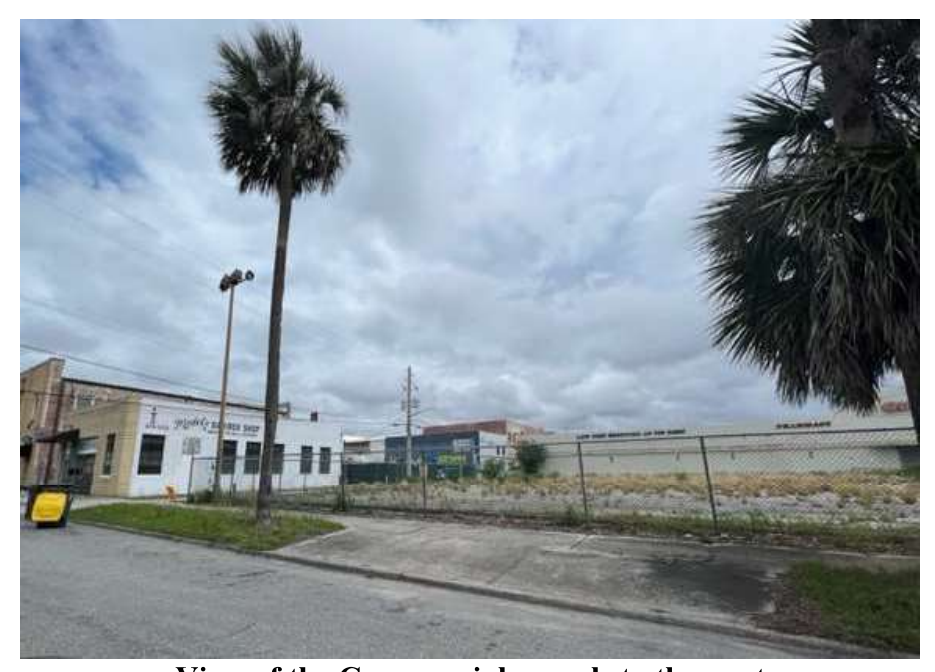
View of the Commercial parcels to the west