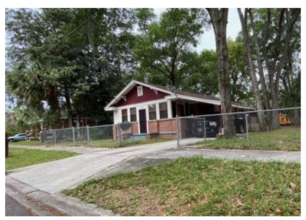
View of adjacent property (single-family dwelling).