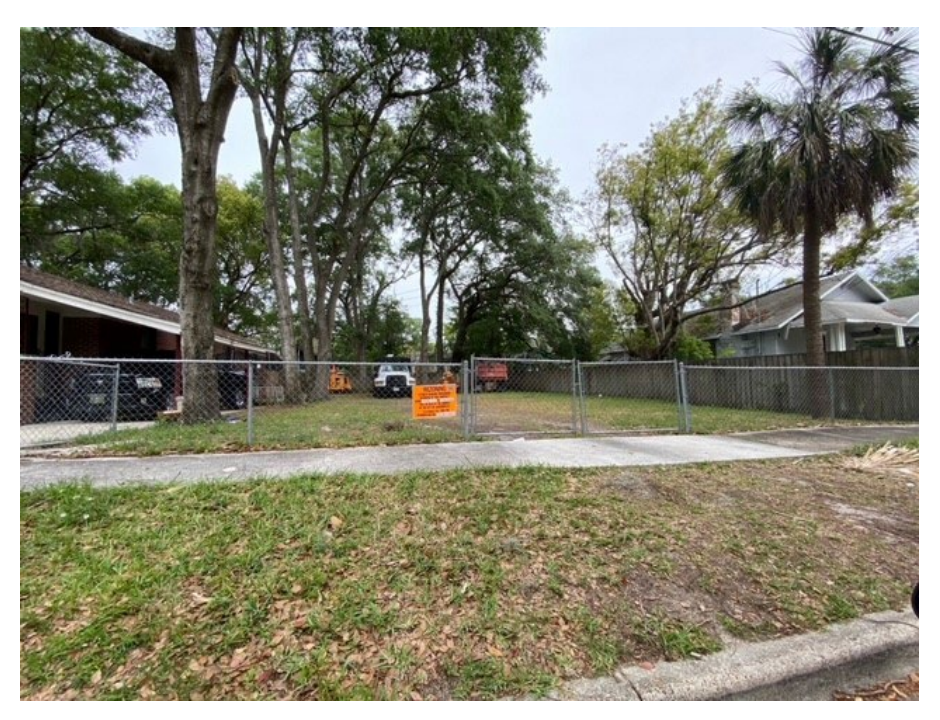
View of subject property.