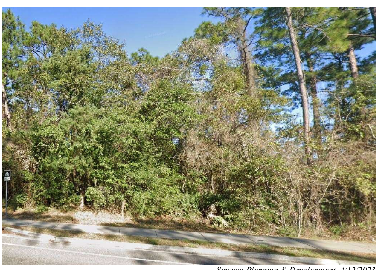
Source: Planning & Development, 4/12/2023 View of the subject property from Broward Road.