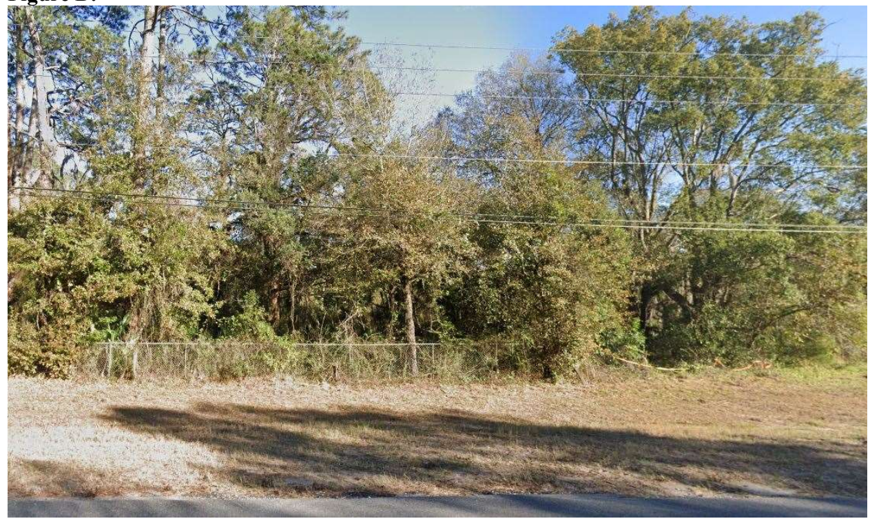
Source: Planning & Development Department, 4/12/2023 View of subject property from North Main Street.