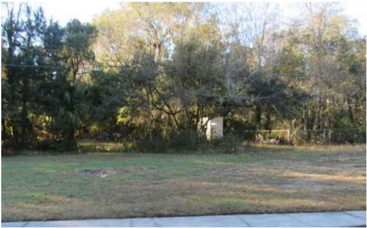
View of subject property