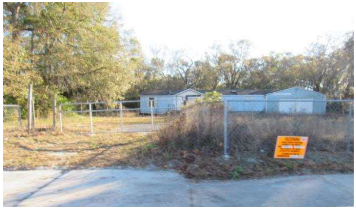
View of subject property