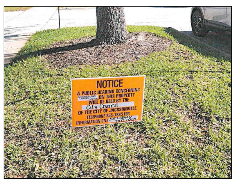
The Required Notice of Public Hearing Signs Were Posted