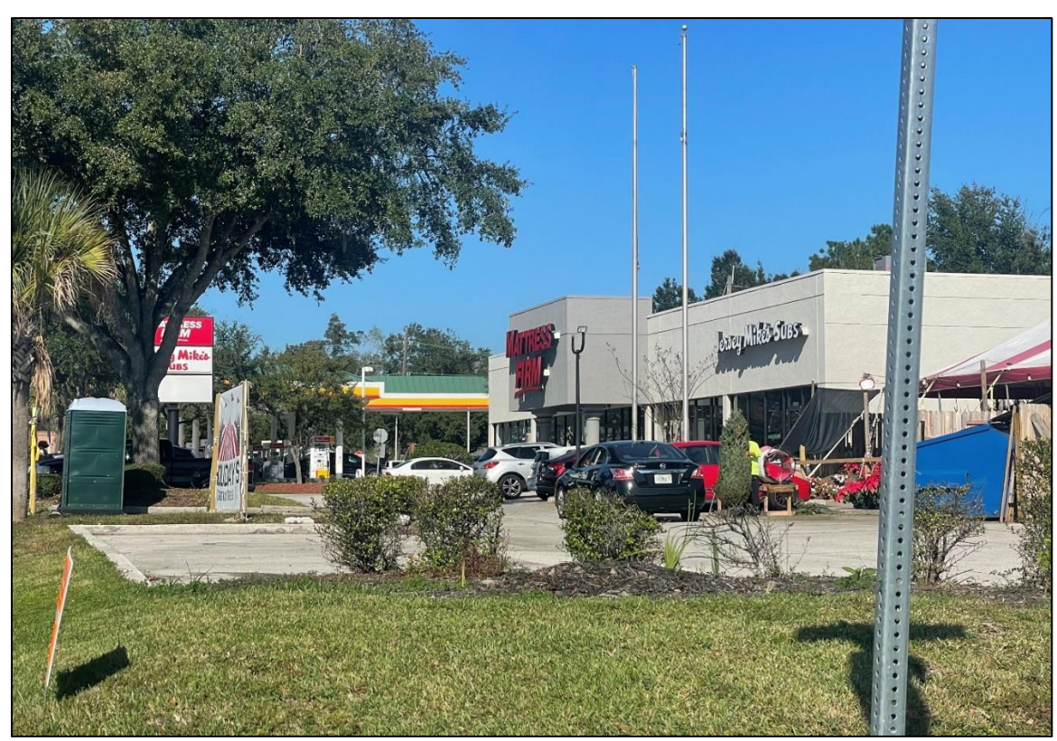
View of the Subject Property

(Date: December 7, 2022)