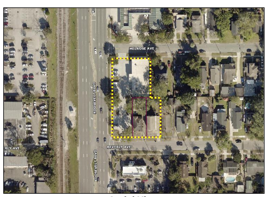
Aerial View

PLANNER RECOMMENDATION: Approve. DATE OF REPORT: January 5, 2023