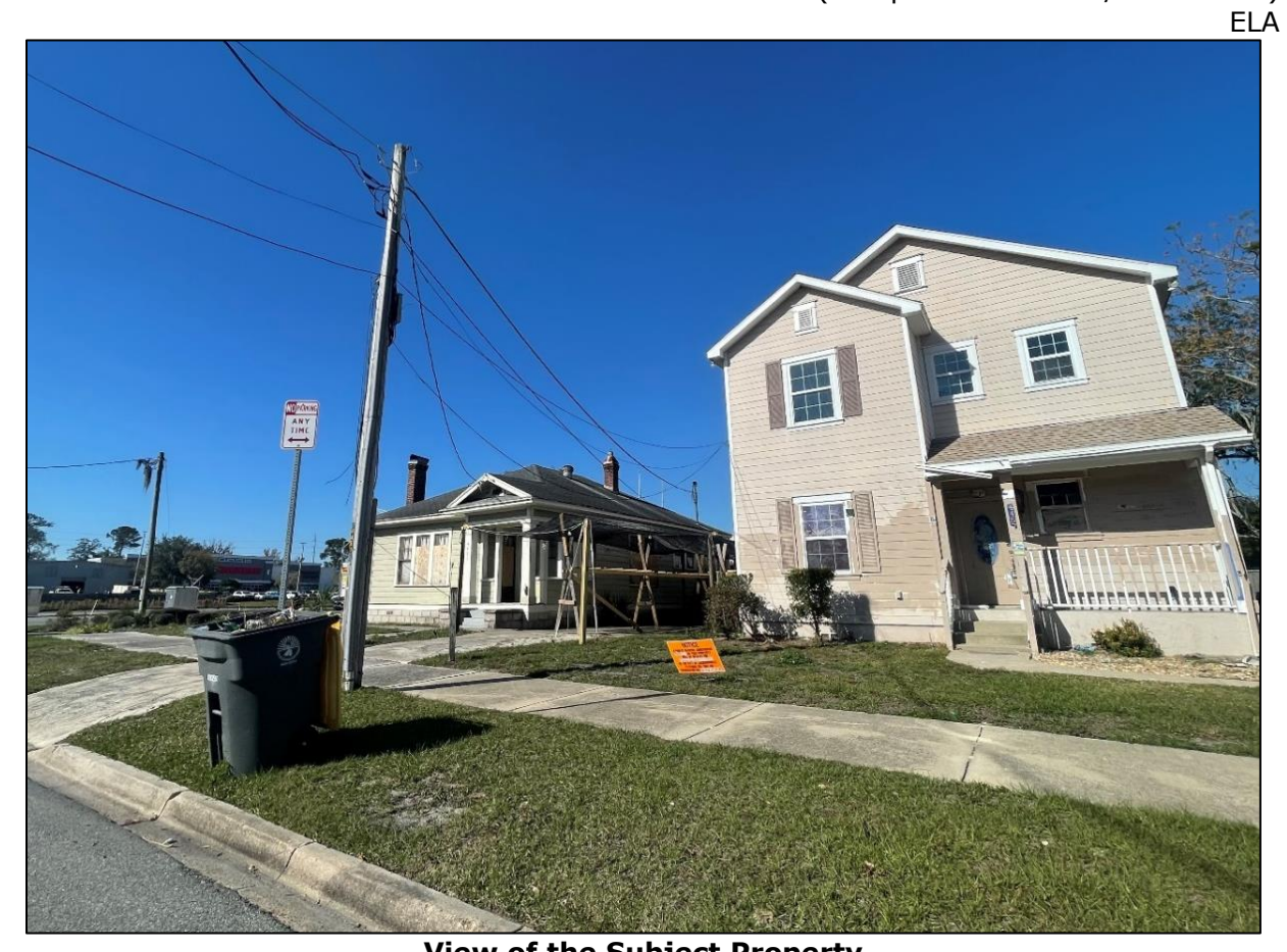
View of the Subject Property (Date: December 7, 2022)