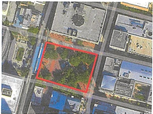
Exhibit A - Limits of Work

The project site, approximately 2 acres in size, is located in Jacksonville, Florida across from the Jacksonville City Hall, bound by W Duval, N Laura, Monroe and Hogan Streets. Formerly named Hemming Park, The City of Jacksonville recently removed a statue of Hemming and renamed the park after James Weldon Johnson. The Park currently serves daytime workers in the area, hosts events and contains rotating and permanent public art. With its recent re-naming, project stakeholders hope to use this opportunity to not only rejuvenate the park's facilities, but also consider its place within the history and culture of Jacksonville and its residents. This initial effort will address both the functional and sociocultural aspects of the park in The James Weldon Park Vision Plan. Through the process, HDS will liaise with the client group(s) and identify community groups to develop an aspirational future for the park. The final deliverable will be schematic in nature, so that the design and its graphics can be used both for fundraising and cost estimating. HDS assumes work for this effort will be limited to within the curb lines of the Park and will not extend into the roadway or adjacent streetscape areas