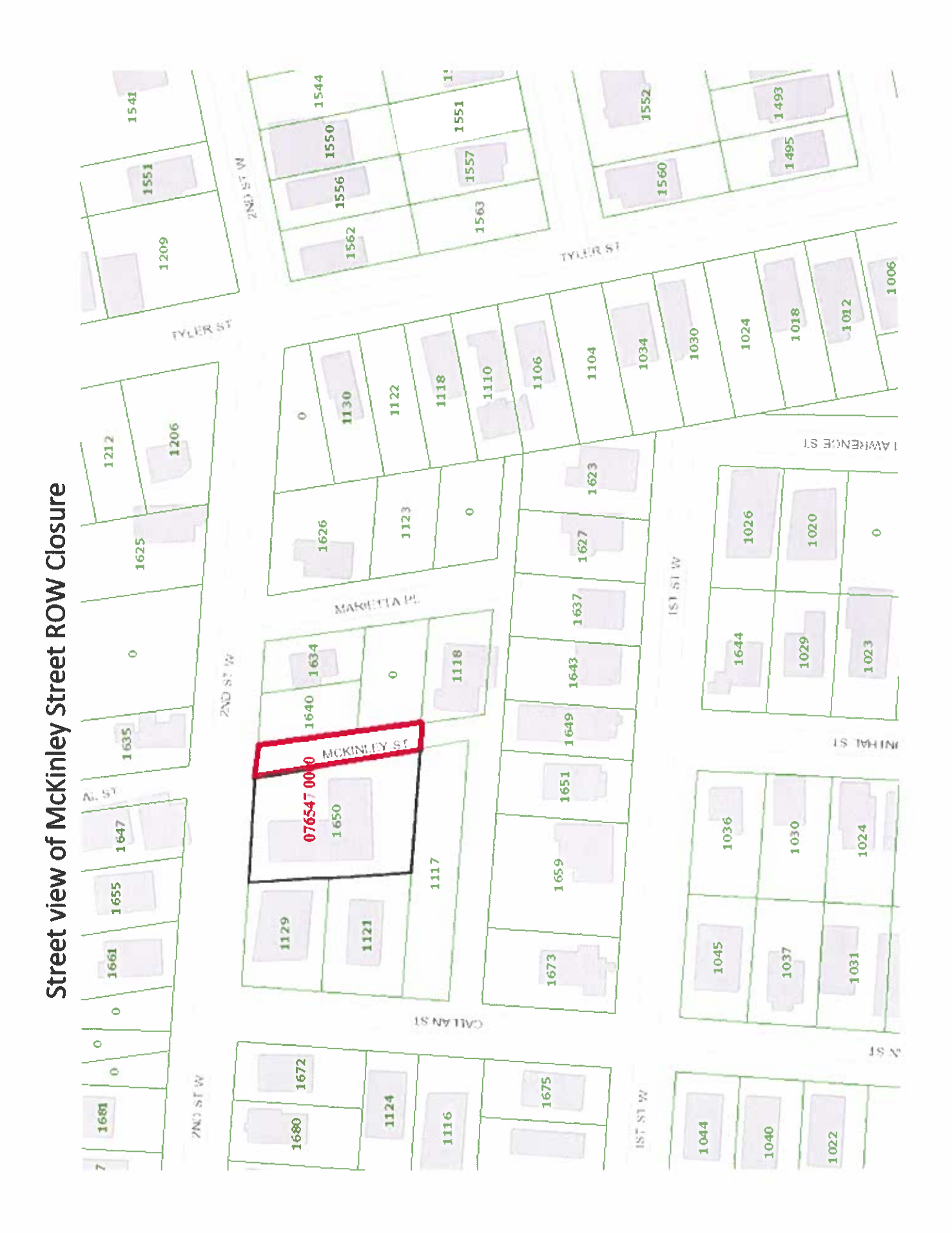
Exhibit 1 Page 1 of 3