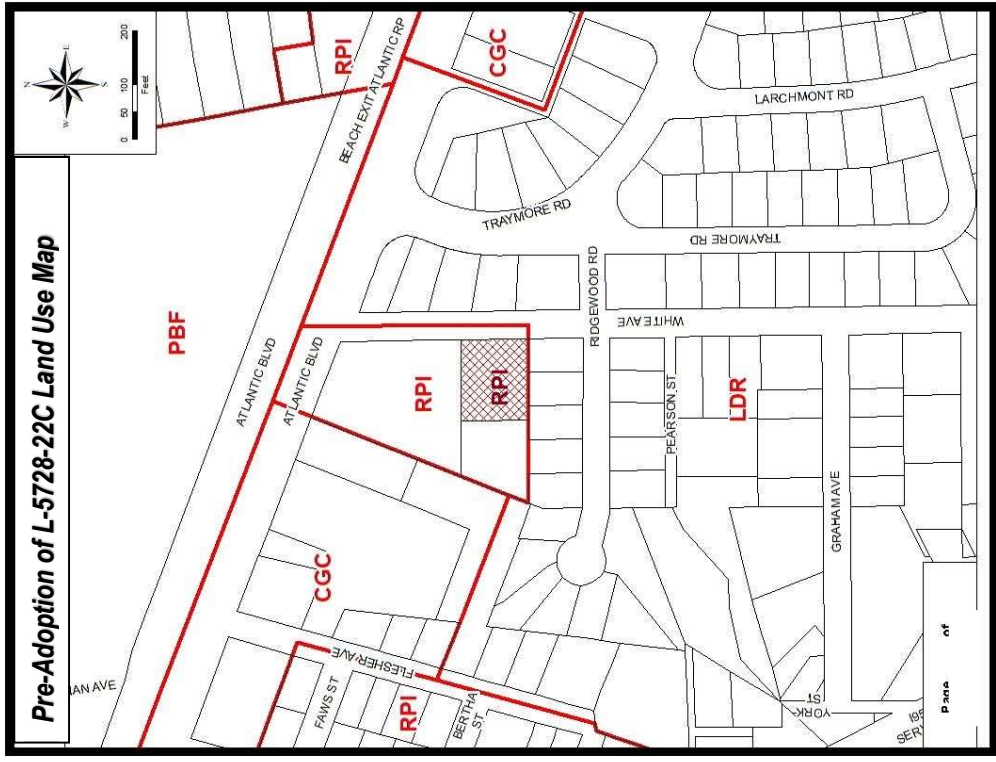
Pre-Adoption of L-5728-22C Land Use Map