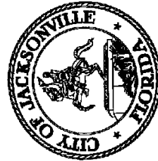
Exhibit 2 (Page 1 of 1)