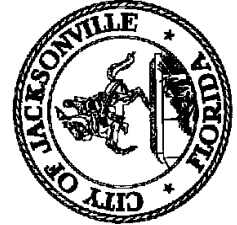
Exhibit 2 (Page 1 of 1)