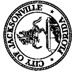
Exhibit 2 (Page 1 of 1)