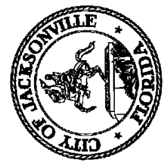
Exhibit 2 (Page 1 of 1)