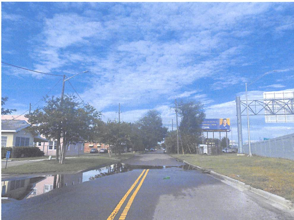
Billboard 2 on Roselle St PUD 2022-0075 NOTE: Residential multifamily and small commercial is across street.