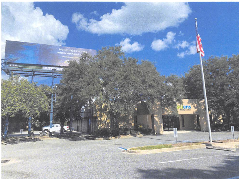
Billboard 1 on Parcel A 2022-0075